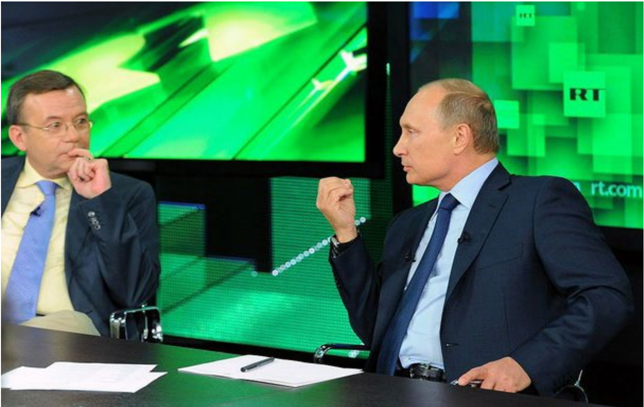
Russian President Vladimir Putin visits the offices of Russia Today in 2013.

the impact of sanctions. These economic networks also ensure that many of the sanctions enacted are likely to ease quickly with de-escalation. Moscow has already demonstrated a particular adeptness for using large energy companies to purchase and invest in regional companies that serve to put Russia in a position to shape economic and political dynamics. This also exposes a transatlantic gap as European markets are far more intertwined with Russia's than are those of the United States, resulting in a European hesitancy to enact meaningful responses. The Kremlin is also assuming that Russia can withstand the financial difficulties of sanctions longer than either the West, enduring its own economic setbacks resulting from loss of trade and exchange, or the war fatigue and potential economic collapse of the eastern European country in conflict.