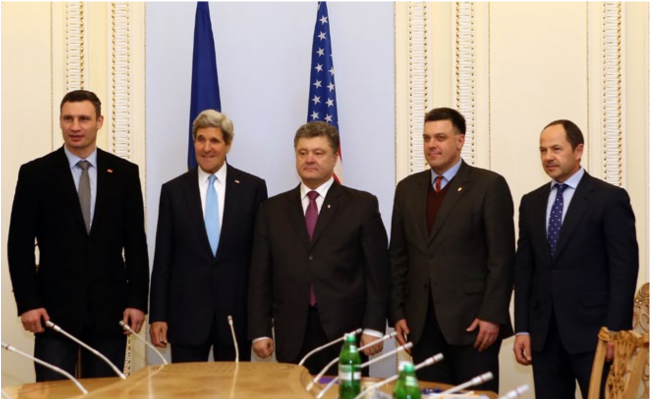
John Kerry meets with Vitali Klitschko, Petro Poroshenko, Oleh Tyahnybok, and Sergey Tigipko at the Verkhovna Rada in Kyiv, Ukraine, in March 2014, just a few months before Poroshenko was sworn in as president.

trade and transatlantic economic growth. TTIP is a trade agreement under negotiation between the European Union and the United States that aims at removing trade barriers in a wide range of economic sectors to make it easier to buy and sell goods and services between the EU and the United States. A successful conclusion to the TTIP negotiations would signal transatlantic unity and establish an economic entity producing roughly 50 percent of the world's GDP and would strengthen the transatlantic community's ability to shape global norms.