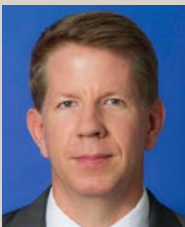
Frederic Wehrey Carnegie Endowment for International Peace