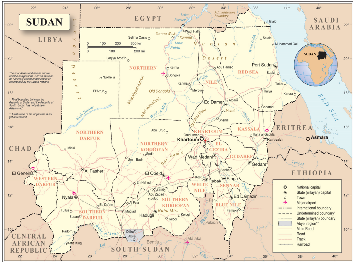
Map No. 4458 Rev.2 UNITED NATIONS March 2012