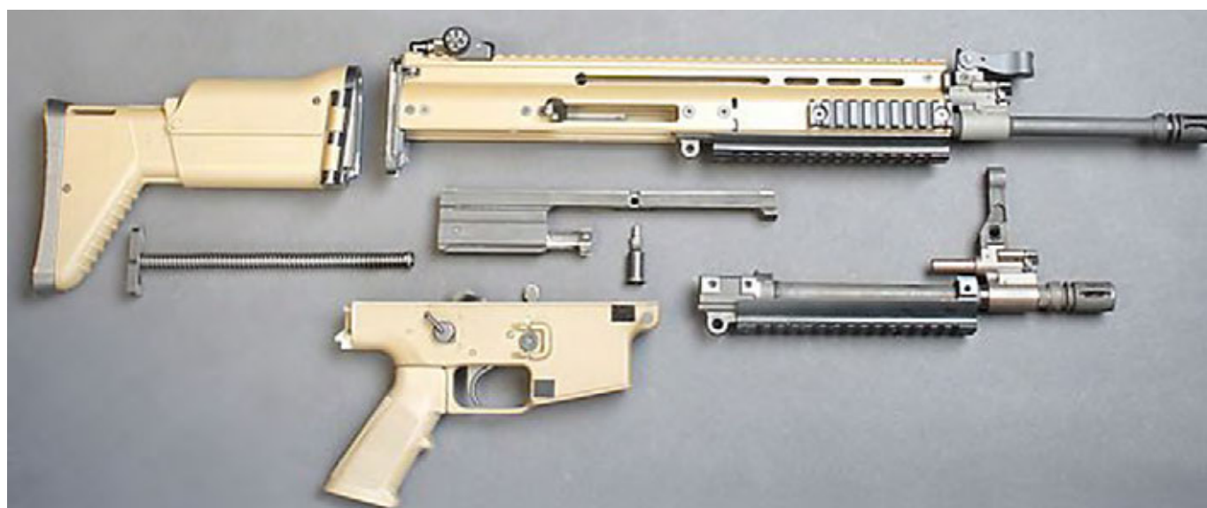
A partially-disassembled SCAR-L (Special Forces Combat Assault Rifle).

A related problem is that, in addition to certain required identifying marks—manufacturer, country of manufacture, and serial number—the