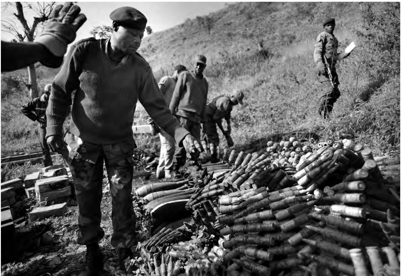
With assistance from soldiers, a MAG (Mines Advisory Group) team take munitions from an open-air stockpile for destruction, near Goma, DRC, September 2012.

One can certainly question the amount of diplomatic effort that went into a meeting outcome that, at some level, is self-evident. Yet that outcome, although unexciting, is in fact useful on several levels. First, compared to the outcomes of previous PoA meetings, the BMS5 text clearly builds on preceding discussions concerning subjects such as women's participation