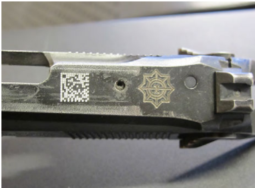
A two-dimensional data matrix code.