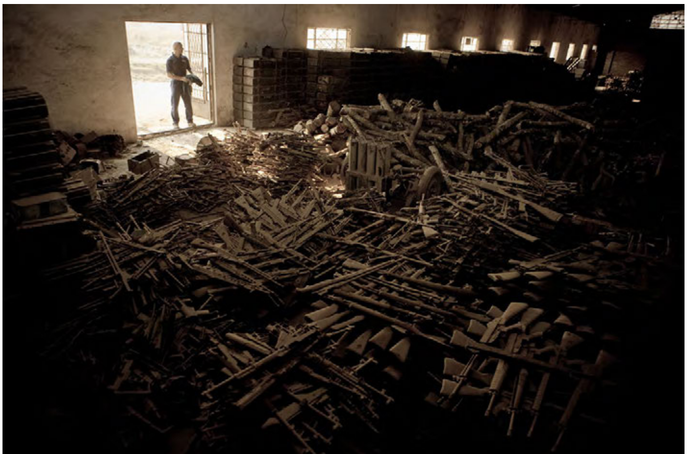
Weapons and ammunition stored in a disused factory in Lubumbashi, Katanga province, DRC, 2009.

Although it is a separate instrument, the ITI, devoted to weapons marking, record-keeping, and tracing, was developed within the framework of the PoA. BMS5 was the third time the UN membership took up the ITI in the context of a BMS. While the first such meeting, BMS3, had seen UN member states engage with the new instrument in a relatively 'practical and focused' way, 34 BMS4 saw them in a holding pattern, with the meeting outcome on the ITI offering little value added over its predecessor. 35 In fact, the BMS5 outcome on the ITI takes its cue not from the BMS3 and BMS4 texts, but from the outcome document of the PoA's Second Review Confer-