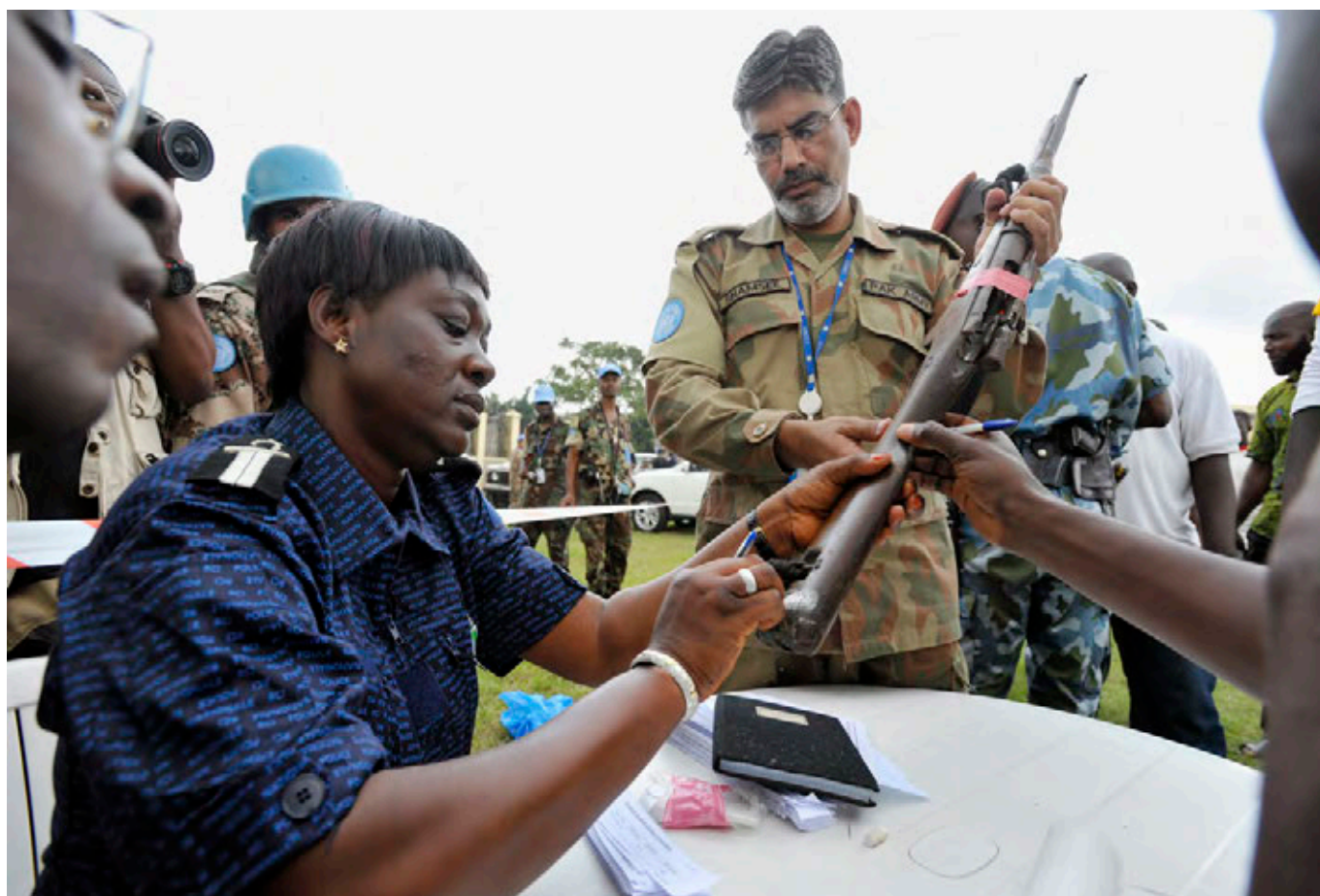
An officer of the disarmament, demobilization, and reintegration programme of the UN Operation in Côte d'Ivoire (UNOCI) supervises the collection of weapons by UN peacekeepers and the Republican Forces of Côte d'Ivoire (FRCI), Abidjan, February 2012.

This more positive assessment assumes that the measures contained in the BMS5 outcome will be translated into concrete laws, policies, and programmes in the communities, countries, and regions affected by small arms violence. The Issue Brief returns to this question later, in its conclusion, but first focuses on another form of follow-up, namely that which can be conducted in UN meeting halls. As noted above, BMS5 did not consider in any depth the implications of new technologies for ITI implementation, leaving this to the governmental experts who will convene at UN headquarters for MGE2 in June 2015 (UNGA, 2014g, para. 40; 2014h, para. 6). The next section of the Issue Brief, finalized in January 2015, looks ahead to MGE2, examining the subjects with which participants will have to contend at that meeting.