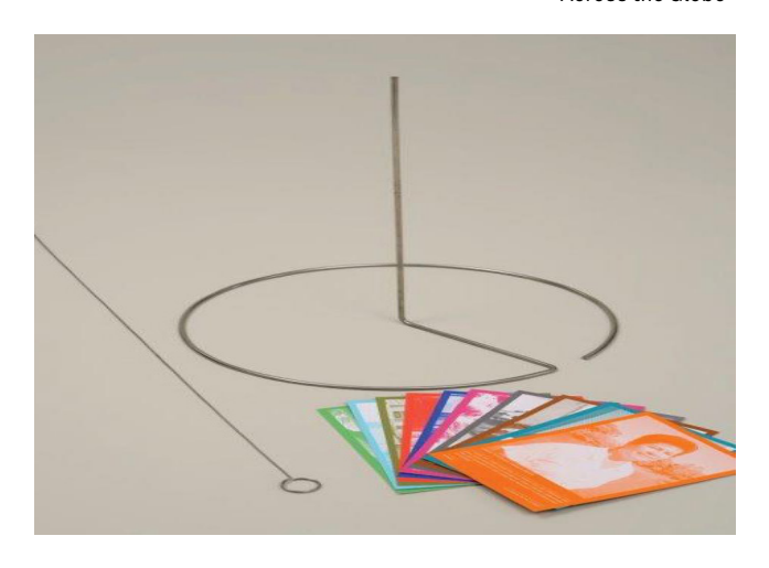
Exhibition "1000 PeaceWomen Across the Globe"

scarcely aware of the significance of gender for conflict-related work and the methods developed by KOFF for gender-sensitive peacebuilding. In addition, few organizational efforts were made to apply the findings from gender work in the area of civilian peacebuilding to the topic areas covered by swisspeace. The Swiss Peace Foundation had therefore shirked its responsibility for this issue to a certain extent: It had provided a forum for it through KOFF, but it had not made the most of its critical potential and usefulness as an enriching crosscutting topic.