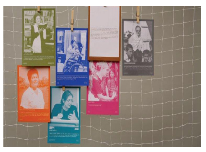
Exhibition "1000 PeaceWomen Across the Globe"

The KOFF gender unit continued to respond readily to requests from external institutions and academics to provide knowledge and expertise, be it in the form of brief consultations, talks, publications, or seminars.