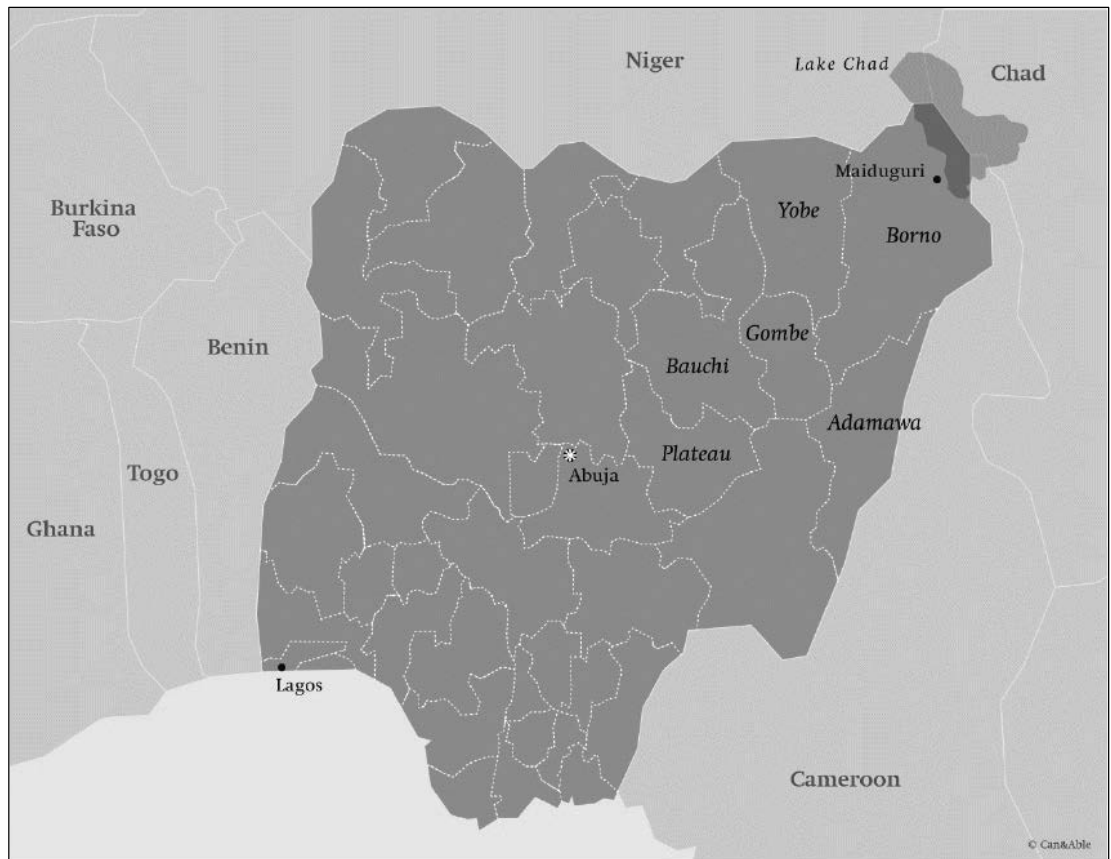
Map 5: Nigeria (north-eastern provinces)

northern Nigeria, southern Niger and northern Cameroon. He criticised the mingling of local religious traditions with Islam by Muslims in these areas, and enforced sharia in the realm he went on to found.