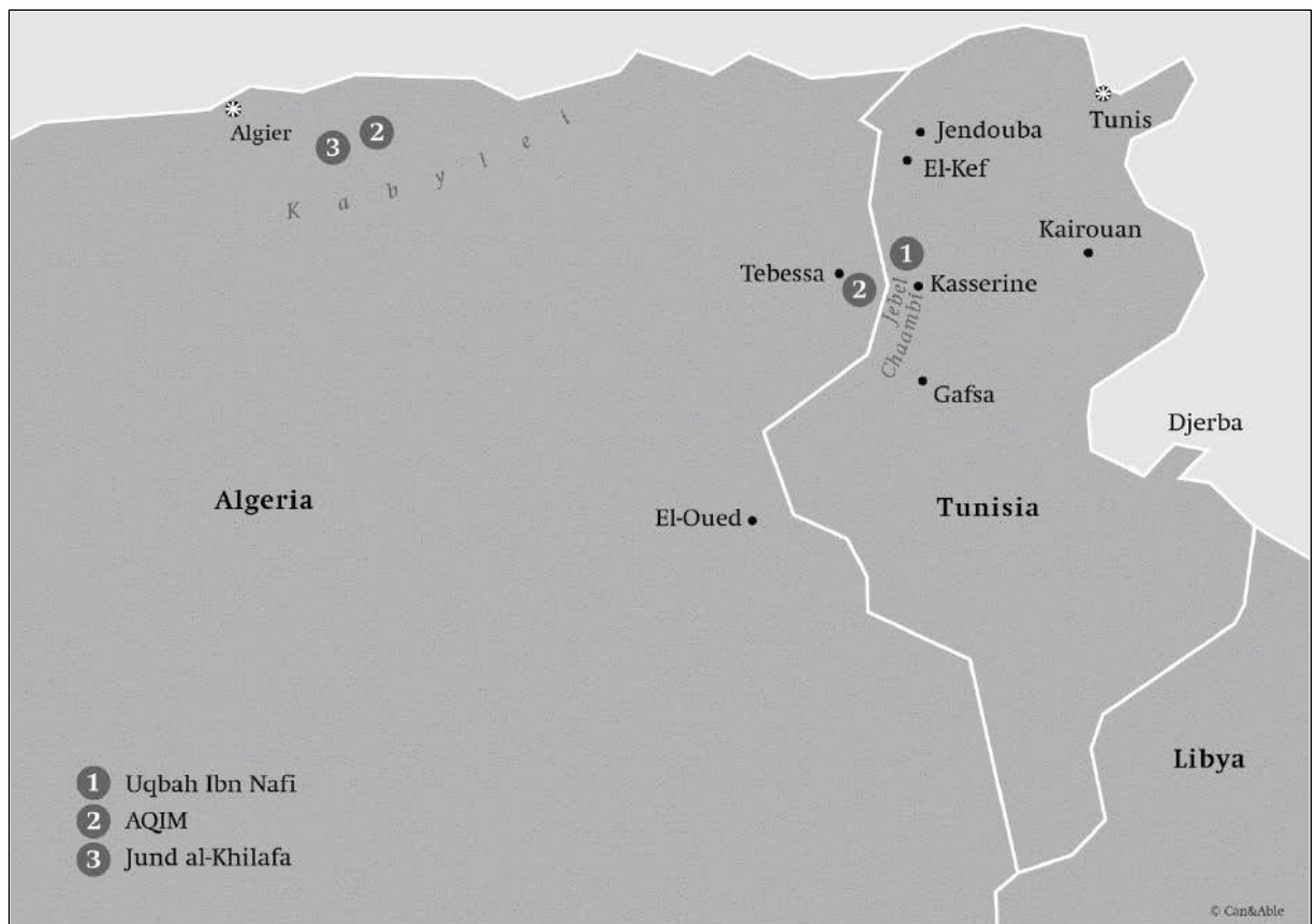
Map 4: Algeria and Tunisia

Another absolutely fundamental factor has been the political exclusion and repression of particular Islamist actors, which has caused one part of that spectrum to become increasingly radicalised. Western interventions and what are felt to be one-sided Western positions in conflicts such as Palestine have further boosted this tendency. The return of battle-hardened jihadists from Afghanistan, Bosnia and Iraq proved especially fateful as they went on to form or support cells in their home countries. Finally, in both states (brief) periods of great political upheaval and the resulting new freedoms gave militant groups space to flourish.