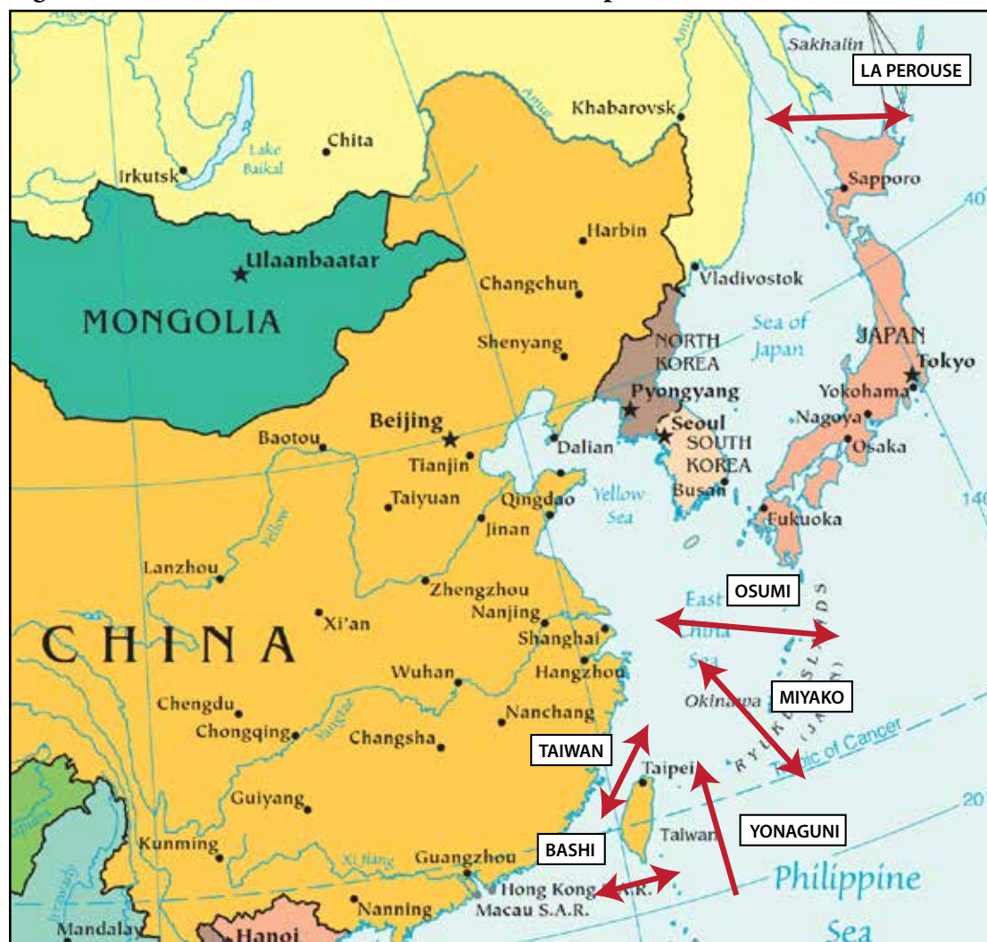
Figure 4. 2013–2014 PLAN Western Pacific Chokepoint Transits

A third likely signal to Japan came from PLAN utilization of the La Perouse Strait following a bilateral exercise with the Russian Navy. Five PLAN ships transited east through the La Perouse Strait and circumnavigated Japan rather than using a direct route and transiting back through the Sea of Japan to their North Sea Fleet homeport following the Vladivostok-based exercise. 87 This deployment illustrates an expansion of SLOCs used by the PLAN to access the Western Pacific; more significantly, Chinese Navy officials referred to the transit as "cutting the