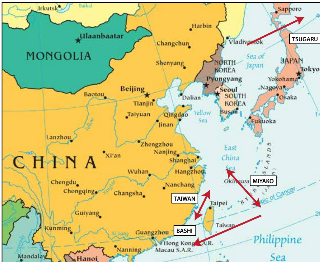
Figure 2. 2004–2009 PLAN Western Pacific Chokepoint Transits

execution of these operations further enhances the PLAN ability to execute near seas active defense and improve capabilities that are also germane to new historic missions.