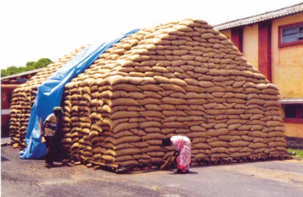
Food Corporation India

Public stockpiling is also considered a strategy for domestic food security and as an alternative to trade-based policies for food. However, there are spill-over effects of adopting such policies internationally. In the case of thinly traded commodities such as rice, should most countries strongly adopt such policies, there is likely to be fewer stocks available globally for exports, potentially leading to limited supply and higher prices. 4 Widespread adoption of stockpiling practices would therefore have the opposite effect to their intended outcomes and exacerbate volatilities in food supply and price. Since 2013, major discussions and disputes in the World Trade Organization (WTO) have centred on the issue of national stockpiling for food security and its acceptability in the global trade regime. A provision allowing public stockpiling for food security purposes has been accepted for the time being. This acceptance, although provisional and supposedly temporary, has made stockpiling an even more popular policy option for governments in order to ensure better food security for their populations. 5