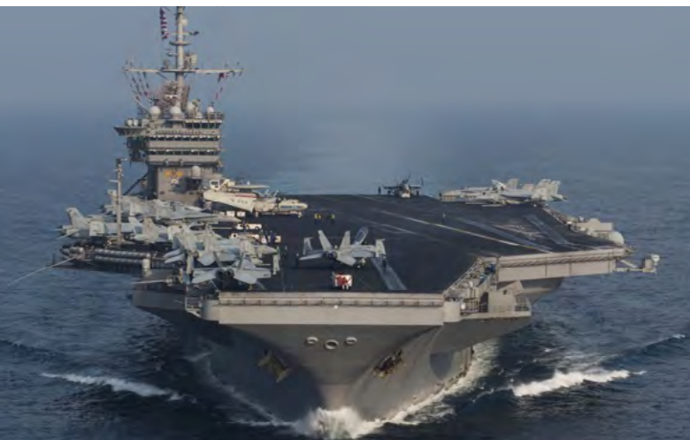
The United States maintains a forward operating posture in the Persian Gulf region, including a substantial naval presence based in Bahrain, such as this Nimitz-class aircraft carrier the USS Harry S. Truman (CVN 75).

The United States could also consider increased arms sales to the Gulf states. Ideally, these should focus on defensive capabilities such as minesweepers and ballistic missile defense that could address the Iranian mining and missile threat. It should also include the types of capabilities that would make its Arab partners more capable at countering the unconventional Iranian challenge, such as tactical tools like night vision goggles and weapons optics, and more strategic capabilities like advanced unmanned aerial vehicles and the networking architecture to enhance air and maritime domain awareness.