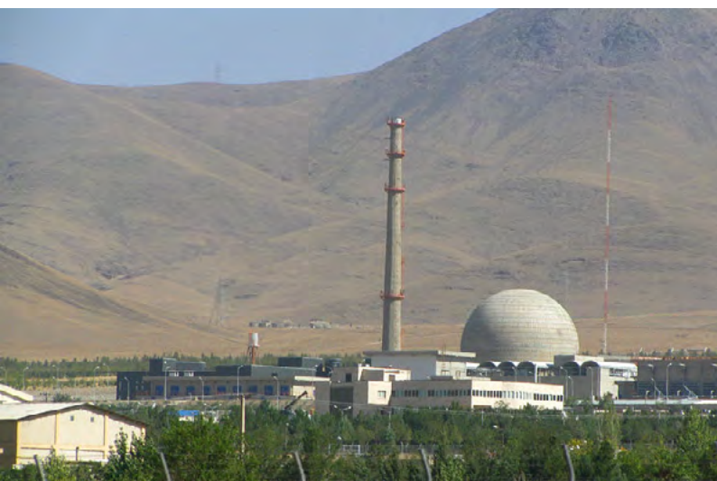
Iran's agreement to alter the design and production capability of the Arak heavy water facility, which if unaltered could be able to produce enough plutonium for two nuclear weapons a year, is a requirement under the nuclear deal.

However, there will be a number of impediments that could prevent other regional states from pursuing Iran's path. It is not easy to build a nuclear weapon. It took Iran years to build its nuclear program, despite having a large and well-educated population. 45 Iran has also paid a tremendous cost, including billions of dollars in investment, onerous sanctions, and isolation in the international community. Additionally, following an agreement there will be a 10–25 year probationary period where Iran cannot take advantage of the technological and civilian energy applications of nuclear technology. The United States will have significant leverage over these states both in the pressure that it can deploy as their primary security guarantor and the incentives it can offer to dissuade them