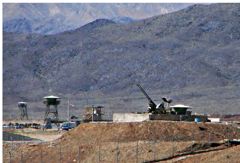
Anti-aircraft guns protect the Natanz nuclear facility.