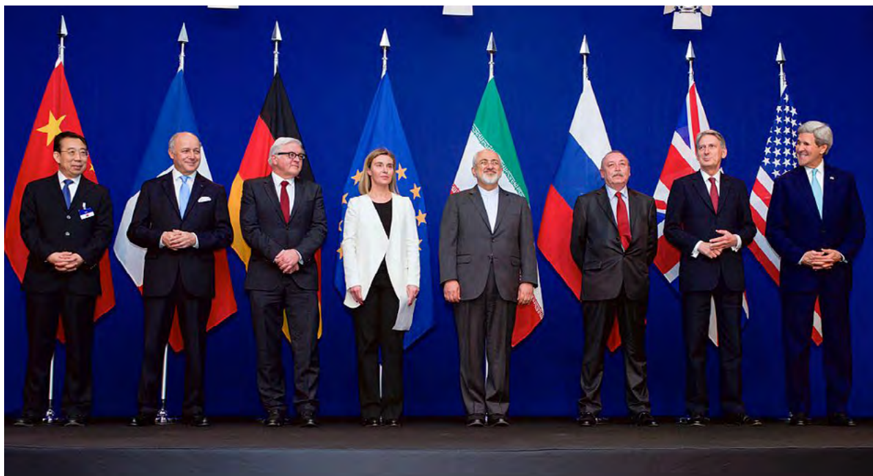
Ministers of Foreign Affairs for the P5+1 (United States, France, United Kingdom, China, Russia, Germany) and Iran celebrate the political framework agreement in Lausanne, Switzerland, in April 2015.

the United States but also for other P5+1 states, as over time personnel changes and new political priorities divert attention and expertise away from the Iranian nuclear challenge.