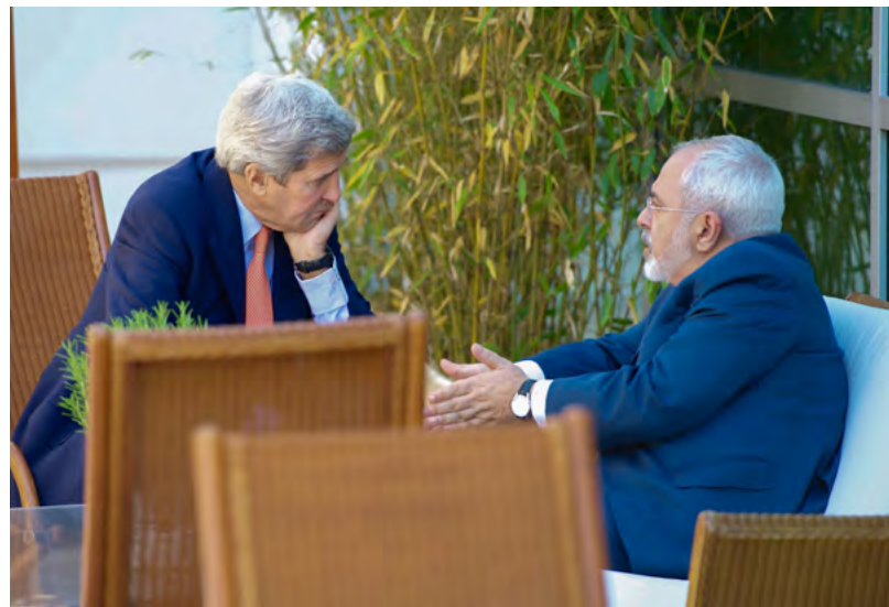
U.S. Secretary of State John Kerry sits with Iranian Foreign Minister Javad Zarif for a one-on-one chat before a broader meeting in Geneva, Switzerland, on May 30, 2015, at the outset of the latest round in the P5+1 negotiations about the future of Iran’s nuclear program.

Another significant question about the nuclear agreement is whether it will change the strategic orientation of the regime and influence not only Iranian capabilities but also intentions. Will the agreement give a boost to pragmatists like Iran’s President Hassan Rouhani and allow him and his faction to wield greater influence on Iran’s foreign policy? Or will Iranian hardliners reassert themselves and pursue more repressive tactics at home and aggressive policies abroad to ensure that the agreement does not lead to a transformation of