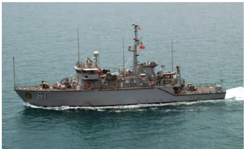
Minesweepers such as the USS Raven (MHC 61), operating off the coast of Bahrain, can protect against aggressive Iranian behavior in the Persian Gulf and help ease the anxieties of U.S. partners in the region.

The United States should take the most positive elements of the agreement with Iran and turn them into global best practices. Renegotiating the Non-Proliferation Treaty is impossible, but there are certainly precedents where improvements have been made to the regime. In 1997 for example, the IAEA instituted the voluntary Additional Protocol to better constrain states from illicitly producing nuclear weapons. 62 Another example is the Nuclear