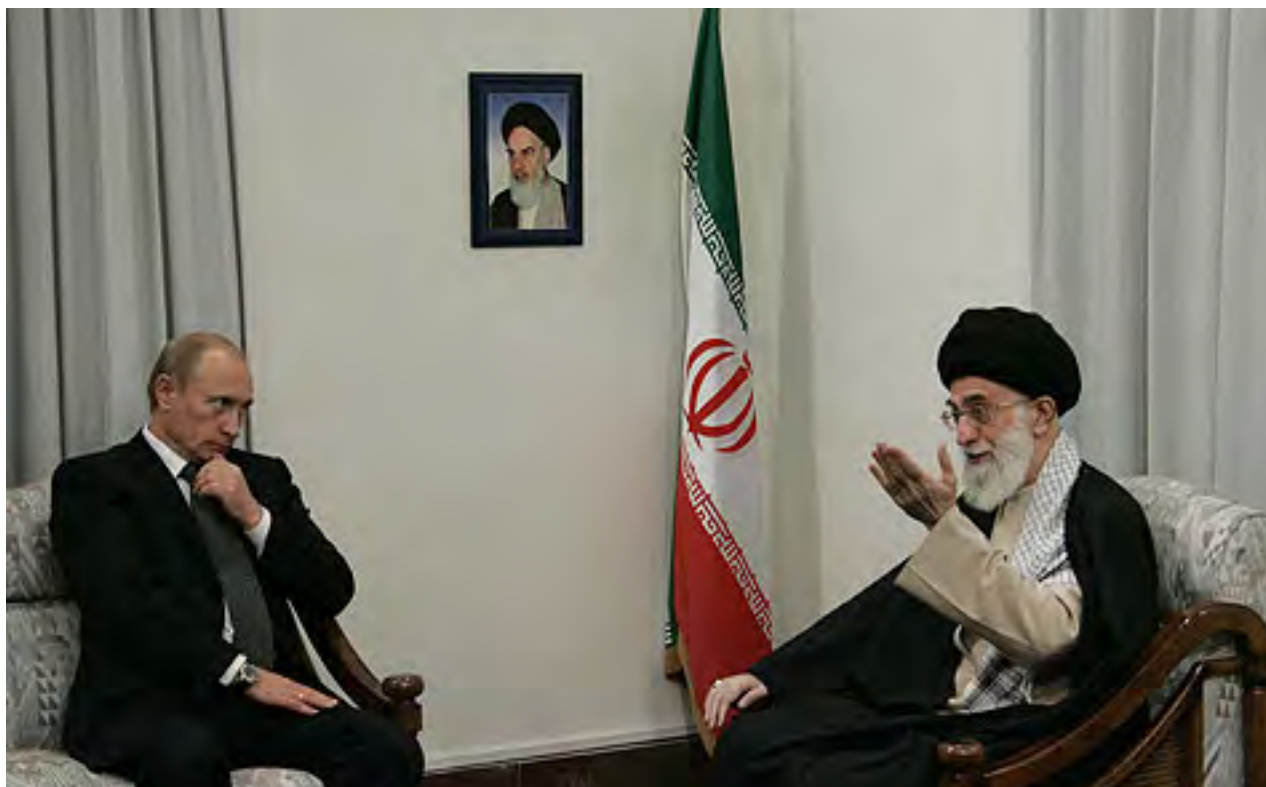
Vladimir Putin meets with Iranian Supreme Leader Ayatollah Ali Khamenei in Tehran, October 2007.

policy outcomes. Allies in Asia have questioned the administration's ongoing commitment to the rebalance, and allies in Europe wonder whether Washington is maintaining sufficient attention to Russia's increasingly aggressive behavior in its neighborhood. While enforcement and implementation of the agreement will continue to require significant amounts of effort by senior political officials, hopefully in the aftermath of the agreement there is an opportunity to shift more time and resources to other issues.