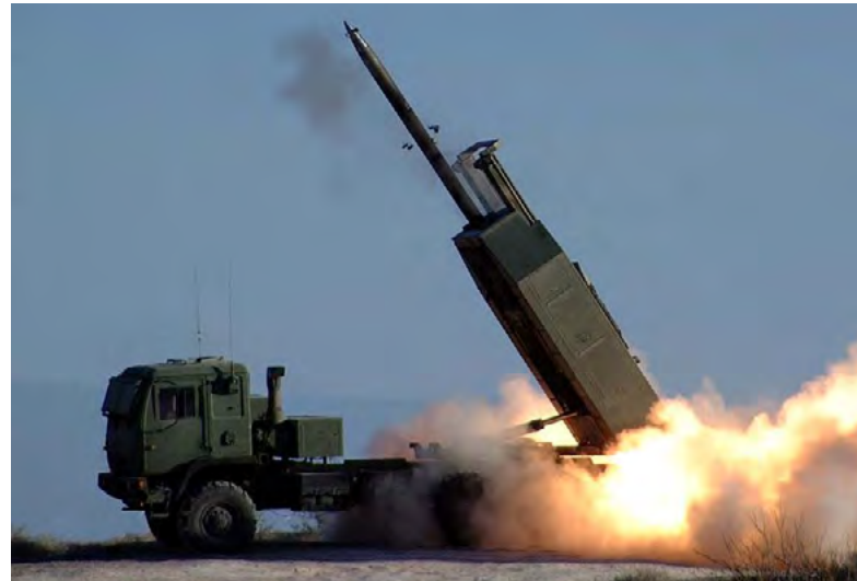
An M142 High Mobility Rocket System (HIMARS) test fires at the White Sands Missile Range in New Mexico. In 2014, the sale of 12 HIMARS worth nearly $1 billion to the United Arab Emirates was approved by the U.S. Defense Security Cooperation Agency. The sale was touted as greatly improving the United Arab Emirates' ability to meet present and future threats, protect its infrastructure, and improve interoperability with U.S. forces.

provisions sunset. The international community's attention will be diverted to other matters, there will be no forceful response, eventually the deal will erode, and Iran will be left with few limits on its nuclear program and no sanctions.