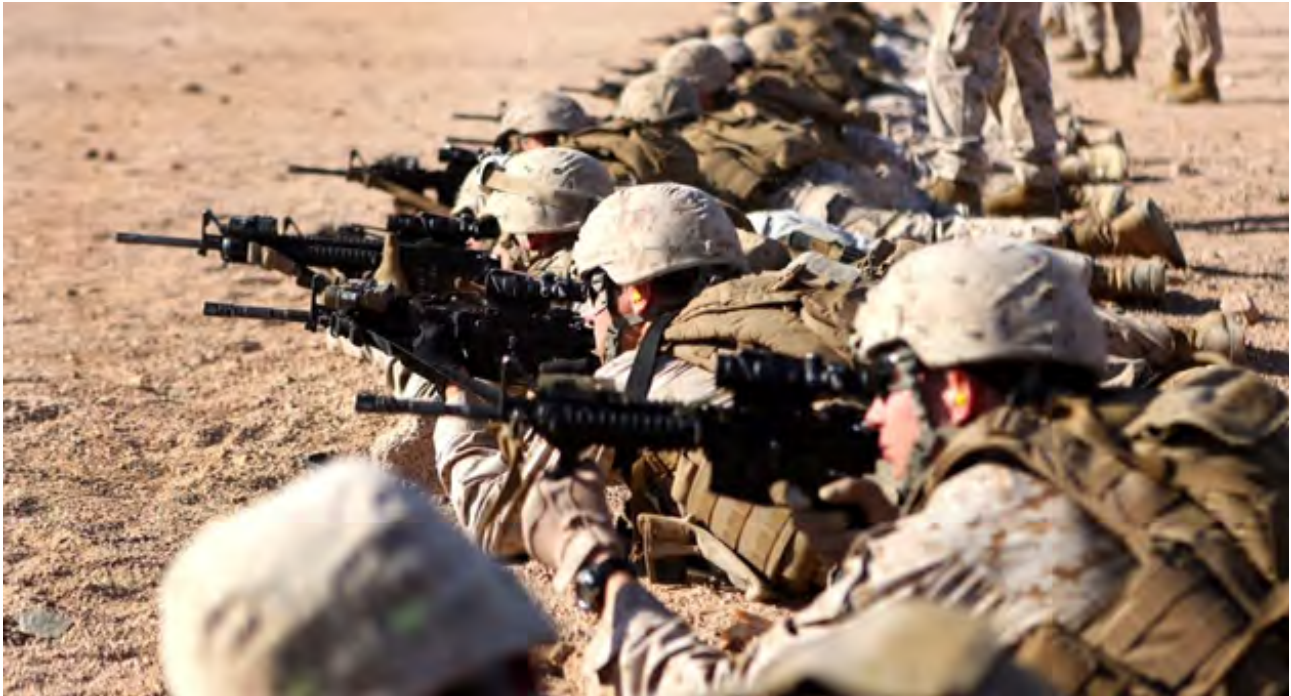
U.S. Marines from Fox Company, 2nd Battalion, 7th Marine Regiment conduct live fire exercises in May 2014's multilateral military exercise Eager Lion. Hosted in Jordan, the event is designed to strengthen military-to-military relationships with U.S. regional partners and enhance Middle East regional security.