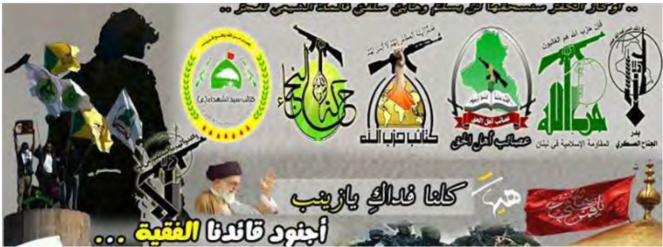
An image supporting the IRGC Quds Force's regional action network of proxy militias reads, "We are all yours, Zeinab! We are the soldiers of our commander, the faqih [jurist]." Faqih in this context refers to the Supreme Leader. In the background Ali Khomeini waves to the Shi'a fighters in the IRGC-QF's network. The militant organization logos that are depicted are, from left to right: Kata'ib Sayyid al-Shuhada'; Harakat Hezbollah al-Nujaba'; Kata'ib Hezbollah; Asa'ib Ahl al-Haq; Lebanese Hezbollah; and the Badr organization.

Some of the Saudi criticism of the American approach is unfair. For the United States the nuclear issue is still paramount, and given the global consequences of Iran's obtaining a nuclear weapon, prioritizing the nuclear question is the right approach. Moreover, some of the frustration with the United States is closely linked to the Gulf states' anxiety about the instability brought on by the Arab Spring – a problem the United States can help manage but not solve.