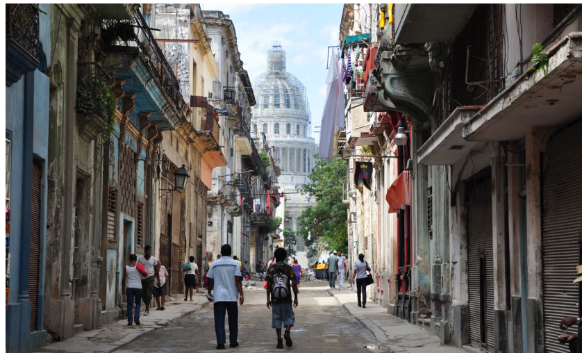
The Cuban government's renovation of El Capitolio signals the many potential changes as it seeks to create a new international image.

Finally, the statutory requirement known as the Gonzalez Amendment (1972) requires that