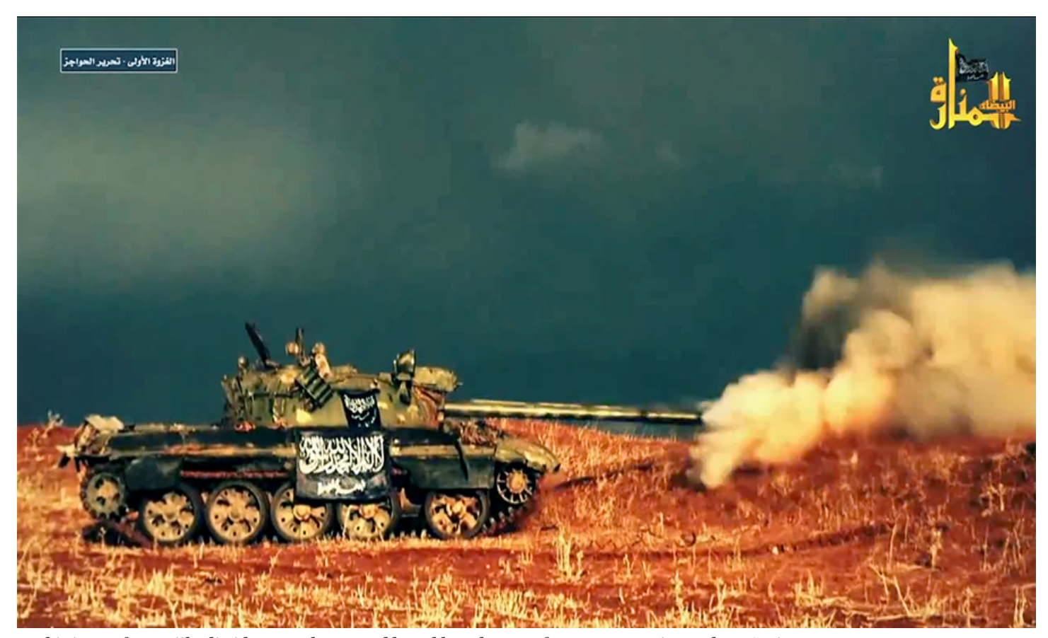
In this image from a jihadi video, a tank operated by Jabhat al-Nusra fires on a target in northern Syria.