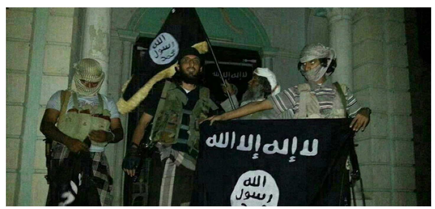
AQAP militants pose in front of a museum in Sayun, Hadramawt province, Yemen.