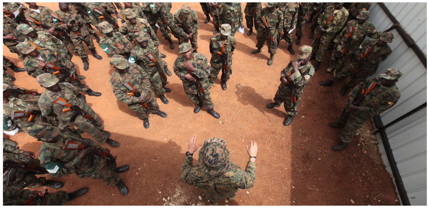
A U.S. Marine trains Ugandan soldiers for the fight against al-Shabab.