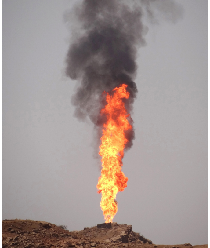
A gas flare near Gachsaran, Iran. Iran's natural gas exports will be the central factor impacting the Euro-Atlantic community's interests in the Eurasian energy infrastructure.

Almost all of Iran's current gas production is domestically consumed. While Iran exports a small volume of natural gas, primarily to Turkey, it has had to import gas from Turkmenistan. 12 In 2013, 90 percent of Iran's 9.2 bcm of