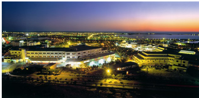
Iran's Chabahar port at night. Iran hopes that the development of Chabahar will boost trade.

New Delhi's INSTC will include multi-modal transportation routes running from the Iranian port through Iran and Afghanistan providing India long denied access to Central Asia. India has had difficulty establishing a position in Central Asian oil and gas production, in part due to its lack of direct access to the region. The INSTC would help eliminate the geographic leverage that Russia and China exert over the Central Asian states' exports and, therefore, their economies.