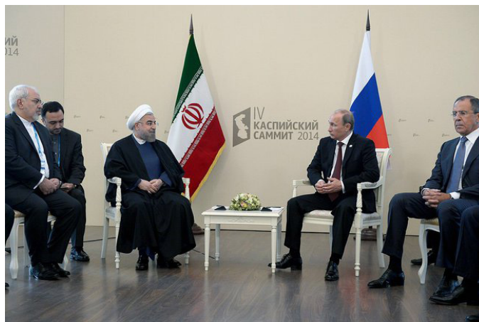
Iranian President Hassan Rouhani (center left) talks with Russian President Vladimir Putin (center right) during Caspian Sea Summit in Astrakhan, Russia, September 29, 2014.