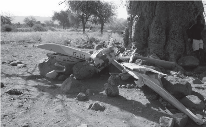
Iranian-made drone, Kurchi, Um Dorein, South Kordofan, December 2014

The SPLA-N has provided the Small Arms Survey with photographs of weapons it claims to have captured in battles fought at the beginning of January 2015. These include two vehicles mounted with machine guns, two trucks, one T-55 tank (another was reportedly destroyed), one ZU-23-2 cannon, and other light weapons. An Iranian-made drone, supposedly shot down by the SPLA-N on 1 December 2014 in Um Dorein county, was visually verified (see photo). Also claimed, but not confirmed, is the SPLA-N's capture in these battles of a new T-72 main battle tank, six DShKM-pattern machine guns, and other materiel and ammunition.