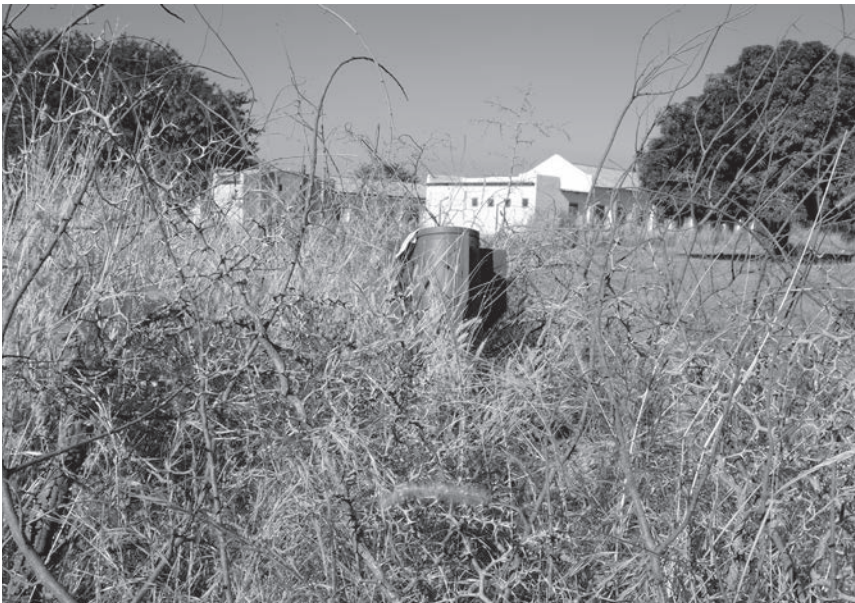
Unexploded ordnance, Kauda area, South Kordofan, November 2014

An increasing use of reconnaissance drones has allowed for more targeted air attacks, and four drones have been shot down since the beginning of the conflict in South Kordofan, including an Iranian Zagil model near Kurchi (Um Dorein) on 1 December 2014. 178 Between May and June 2014 some 60 bombs were dropped in the Kauda area, targeting a local NGO and a clinic that were