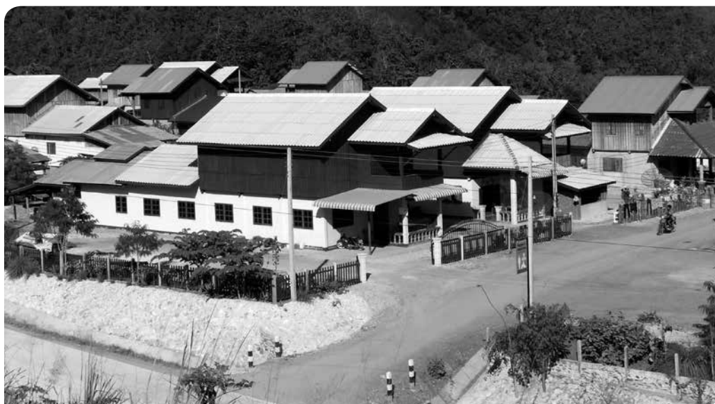
One of the villages relocated for construction of the Xayaburi Dam.