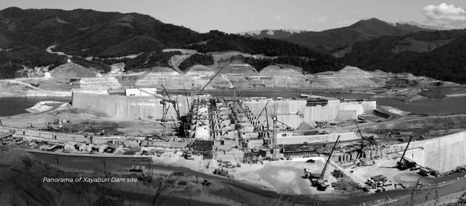
Panorama of Xayaburi Dam site.

CRITICAL TECHNICAL REVIEWS OF BOTH PROJECTS BY MRC EXPERTS HAVE CAUSED THE DEVELOPERS TO SPEND HUNDREDS OF MILLIONS OF DOLLARS TO ATTEMPT TO MITIGATE THE MOST IMPORTANT ENVIRONMENTAL AND SOCIOECONOMIC IMPACTS.