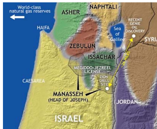
Megiddo-Jezreel Valley license

Now, Zion Oil holds the Megiddo-Jezreel Petroleum Exploration License that comprises approximately 99,000 acres, and is proposing to drill about 26 miles south of the recent Genie oil discovery.