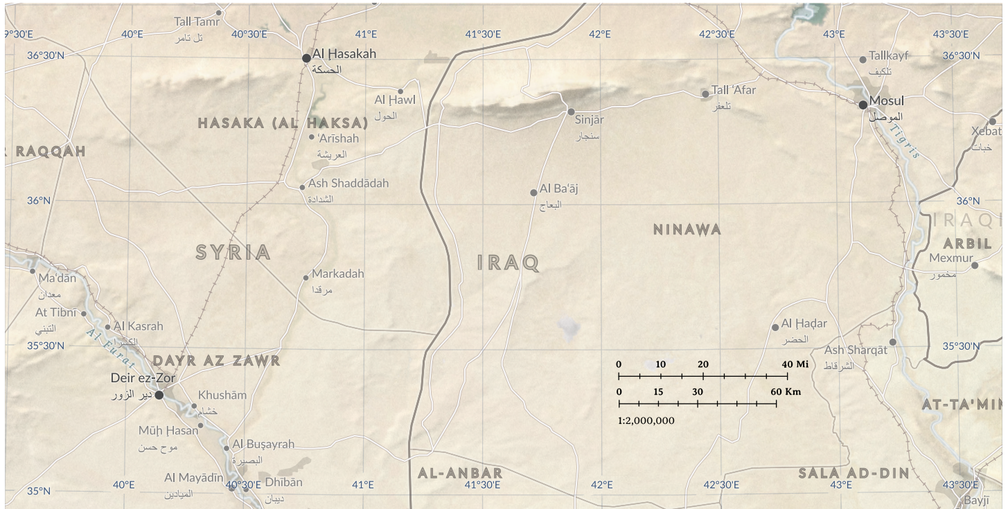
Northern Iraq and Syria