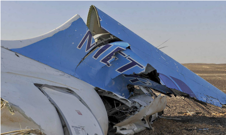
The wreckage of Metrojet Flight 9268