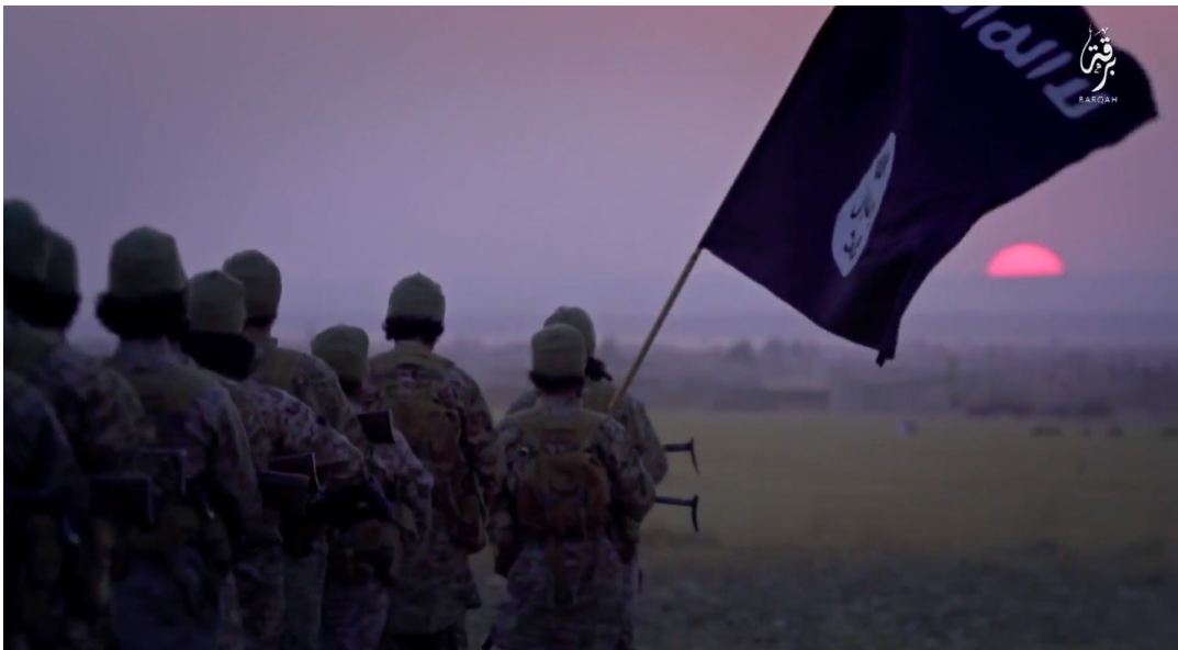
This image from an Islamic State video shows fighters training in Libya.

Although propaganda videos have shown foreign recruits burning their passports, and