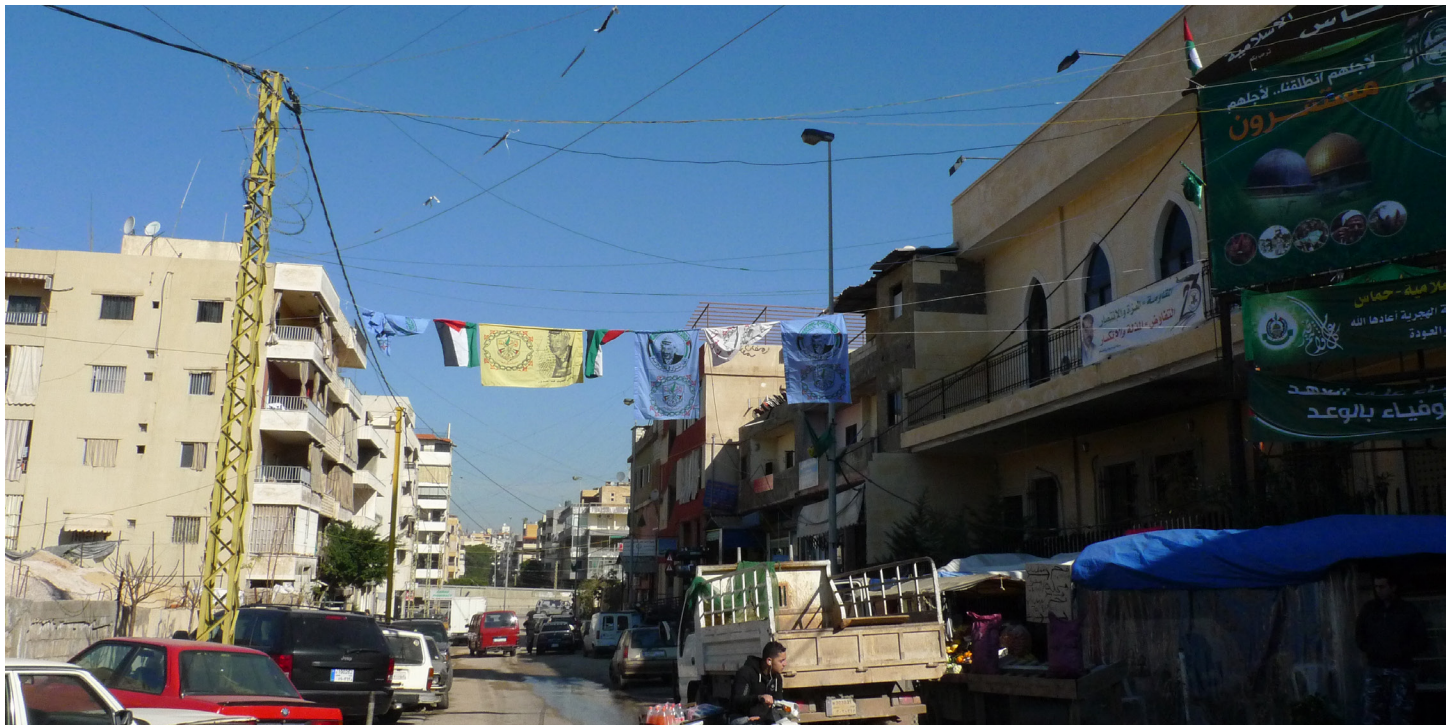
The entrance to Bourj el-Barajneh camp in southern Beirut.