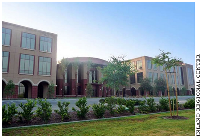
INLAND REGIONAL CENTER