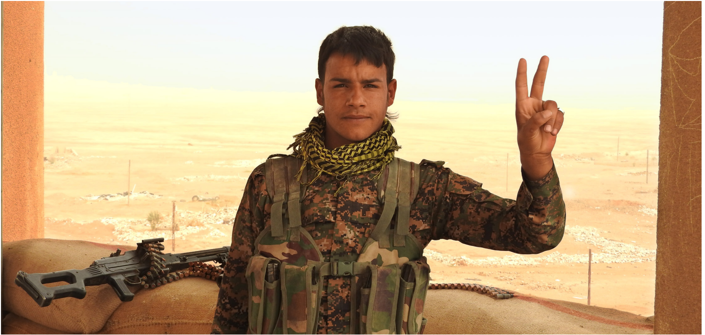
A YPG fighter in Hasakah, Syria