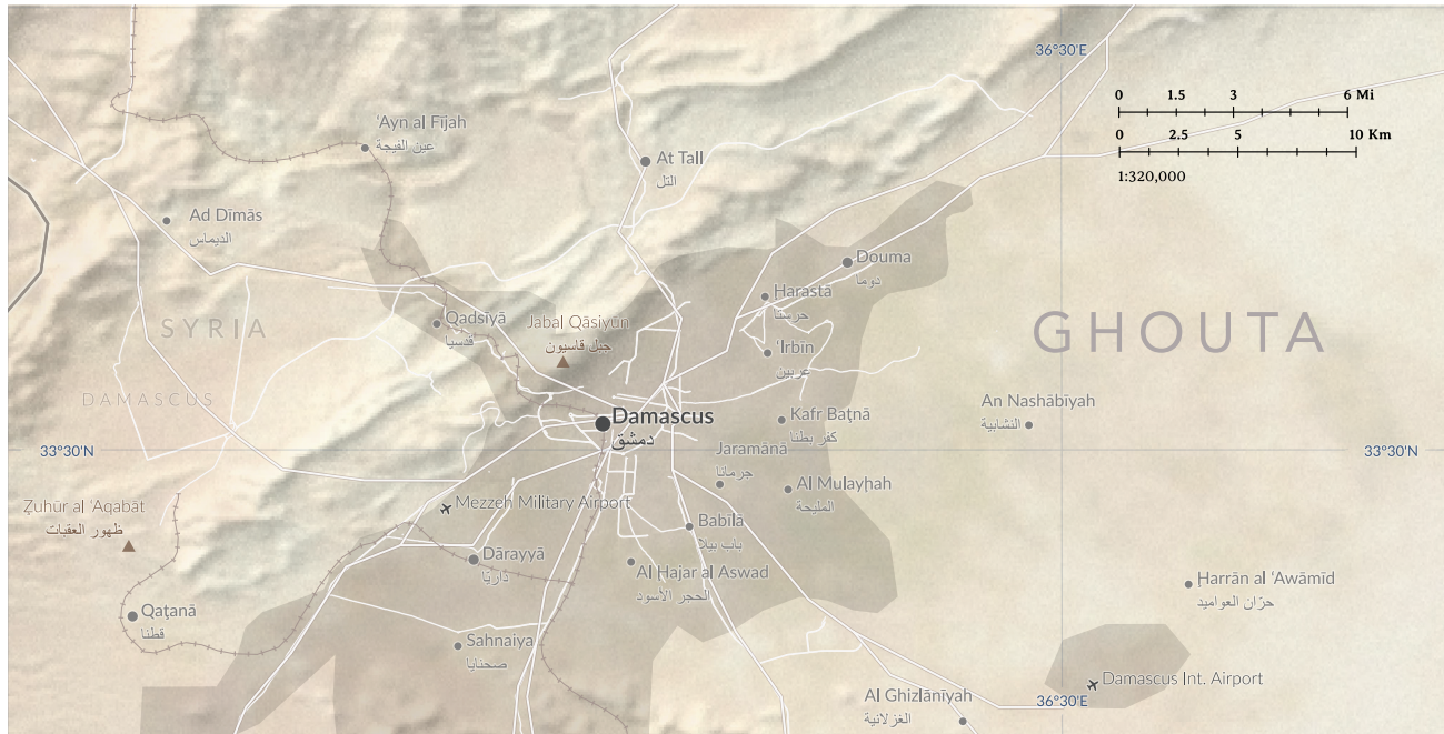
Damascus and environs