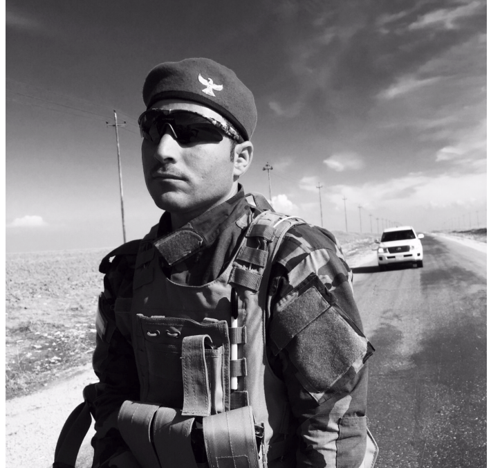
A Yazidi fighter near Mt. Sinjar, Iraq.

The fractured nature of the battlefields on either side of the Iraqi-Syrian border mean that the Islamic State is neither the only