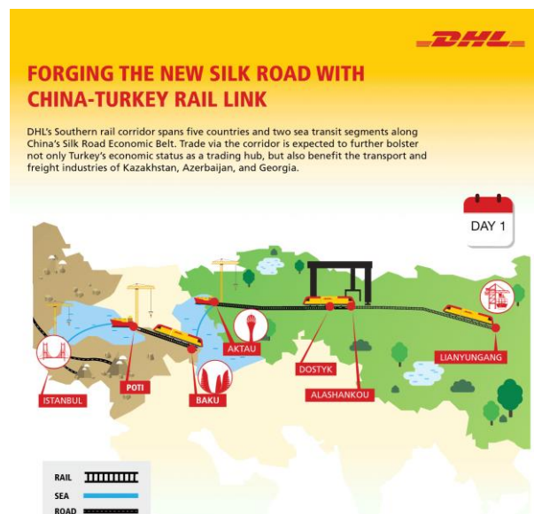
Map 1: China-Turkey Rail Link