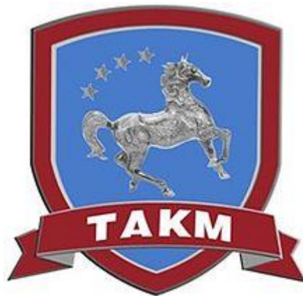
Figure 1: TAKM: Organization of the Eurasian Law Enforcement Agencies with Military Status 14

Given China's SCO is already cooperating with Russia's Eurasia Union/CSTO for regional stability, whether Erdoğan would coordinate with China, Russia, India and Iran or maintain the current hostile posture driven by his anti-Assad obsession remains to be seen.