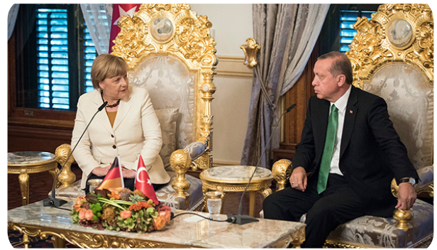
German Chancellor Angela Merkel and Turkish President Recep Tayyip Erdoğan, Istanbul, 18 October 2015.

Second, we will hear more references to the idea of the “New Turkey.” The AK Party’s election victory will have significant consequences for the way in which we will discuss Turkish modernity, secularism, the new middle classes, lifestyles, and identities. Then-Prime Minister Recep Tayyip Erdoğan had already laid out the central tenets of the New Turkey in the aftermath of the 2011 general elections. He shared with the Turkish public a more elaborate vision of the New Turkey during his victory speech in the 2014 municipal elections. With Erdoğan’s ascension to the highest echelon of the Turkish state as the first publicly-elected president, the implementation of the New Turkey has begun.