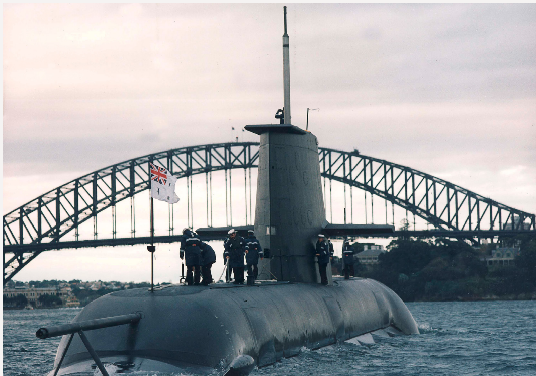
Collins class submarine.

The Future Submarine Project is a wonderful case study of defence acquisition. Because of its scale and time frame, it spans every aspect of defence decision-making from long-term strategic crystal ball gazing, including the possible impact of future technologies, through military strategy development and force structuring, all the way to robust politics of shipyard jobs.