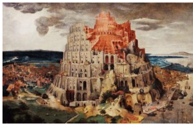
Tower of Babel

Kerry says that if the Syrian ceasefire breaks down, he has a plan B to partition Syria along ethnic and religious lines. If this happens, will it signal the end of the Westphalian concept of sovereignty? That is, the legal concept that establishes the rule of nation states over their own territories and domestic affairs as a guiding principle of international law?