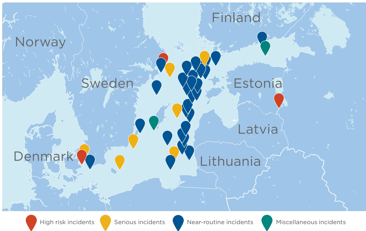
Map 1. Incidents involving NATO and Russia