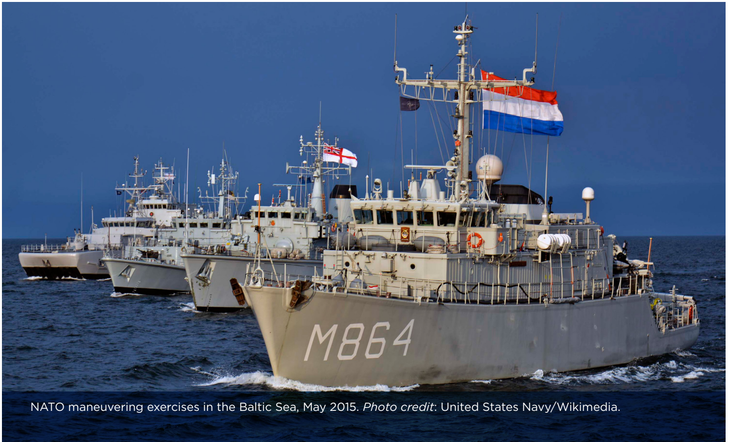
NATO maneuvering exercises in the Baltic Sea, May 2015.

to incorporate Finland and Sweden as part of their partnership efforts. 2