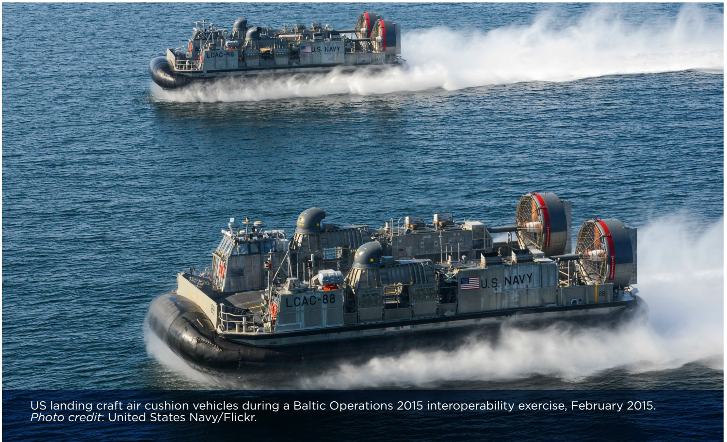
US landing craft air cushion vehicles during a Baltic Operations 2015 interoperability exercise, February 2015.

submarines, along with twelve patrol boats with limited anti-submarine warfare capabilities.