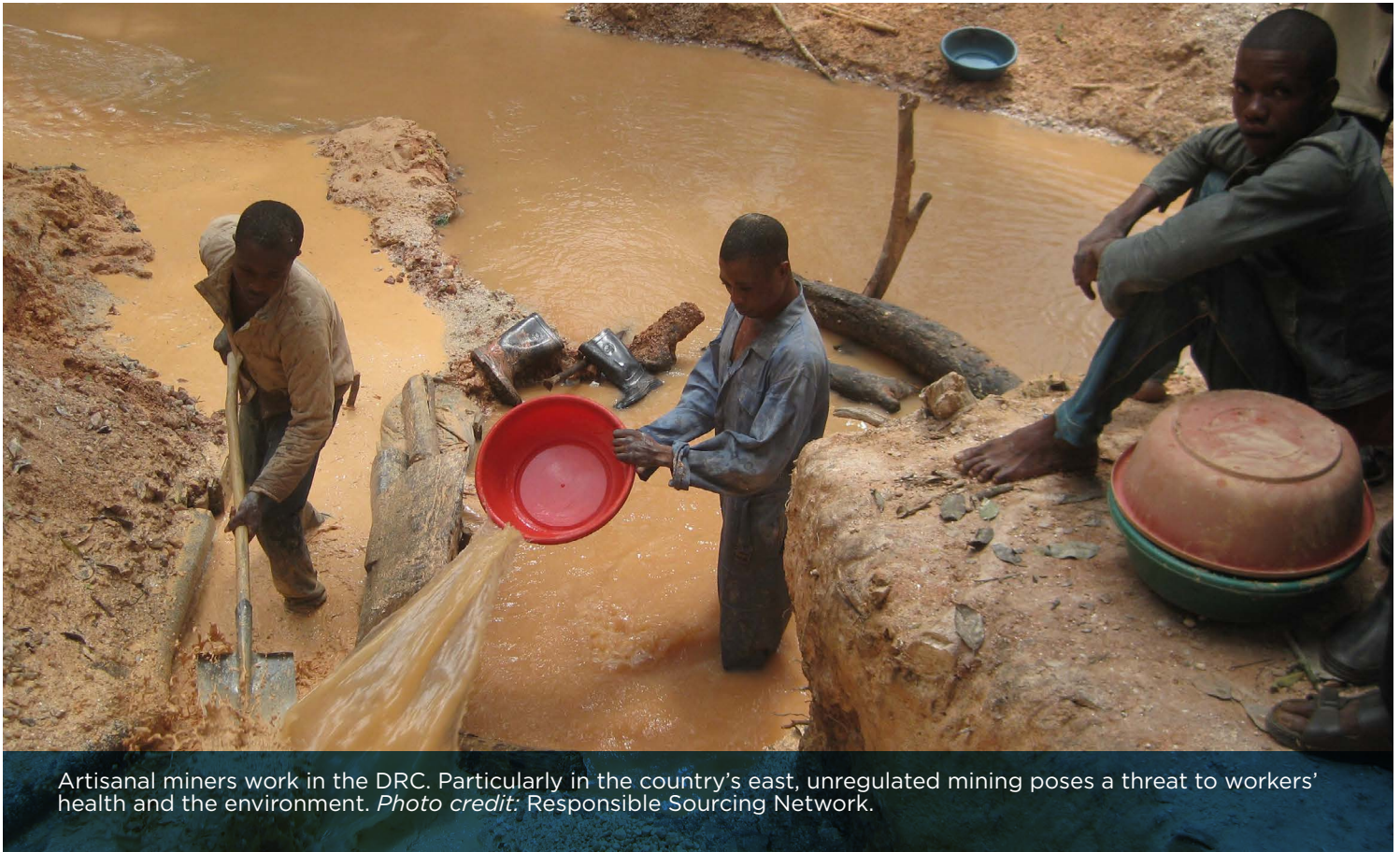
Artisanal miners work in the DRC. Particularly in the country's east, unregulated mining poses a threat to workers' health and the environment.

and Sudan or between Rwanda and Burundi, may presumably be used as a pretext for declaring a state of emergency—and a more convincing excuse for delaying elections than the need to update the voter rolls. But this tactic is akin to lighting a cigarette in an ammunitions storage room. In 1996, an entire third of Africa erupted into war from an eerily similar mixture of internal, sub-regional, and regional quarrels.