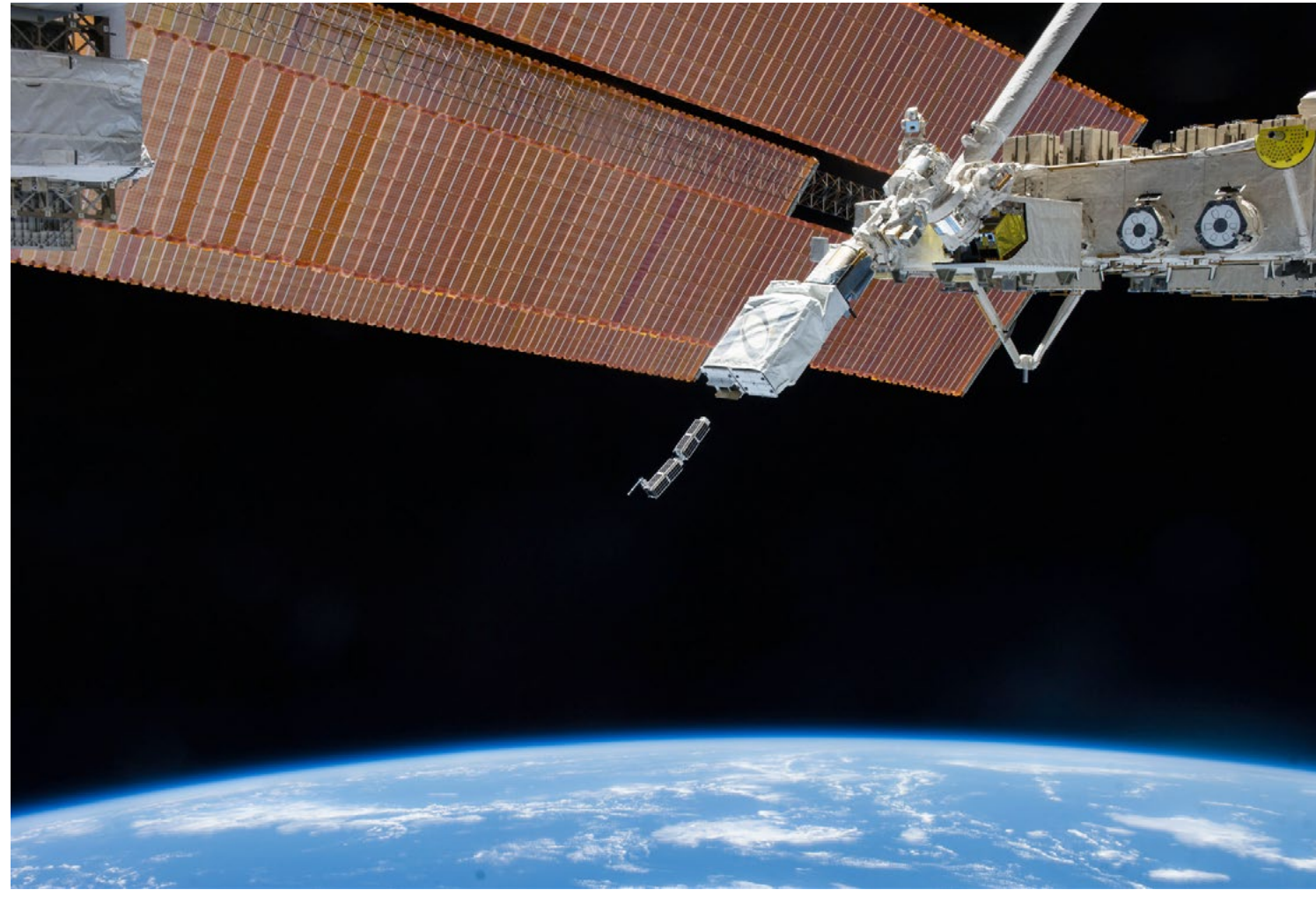
Inexpensive, small satellites (or "cube sats") are lowering the cost of geospatial information by offering high-quality commercial imaging. Here, Planet Labs cube sats are launched from the International Space Station.

shortfalls in ISR capacity.<sup>46</sup> Their statements are particularly notable because CENTCOM and PACOM generally are the highest-priority commands for resourcing. Between the two of them, they are likely getting the lion's share of U.S. military ISR assets. Yet gaps still remain.