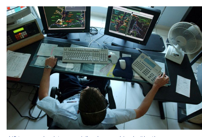
AIS transponder data, especially when combined with other sensor platforms like radar systems, provide crucial information for maritime domain awareness. Here, the New York Harbor's Vessel Traffic Center monitors port traffic. (Wikipedia)

While AIS and ADS-B are valuable publicly available tools, they establish only an initial baseline for situational awareness. They