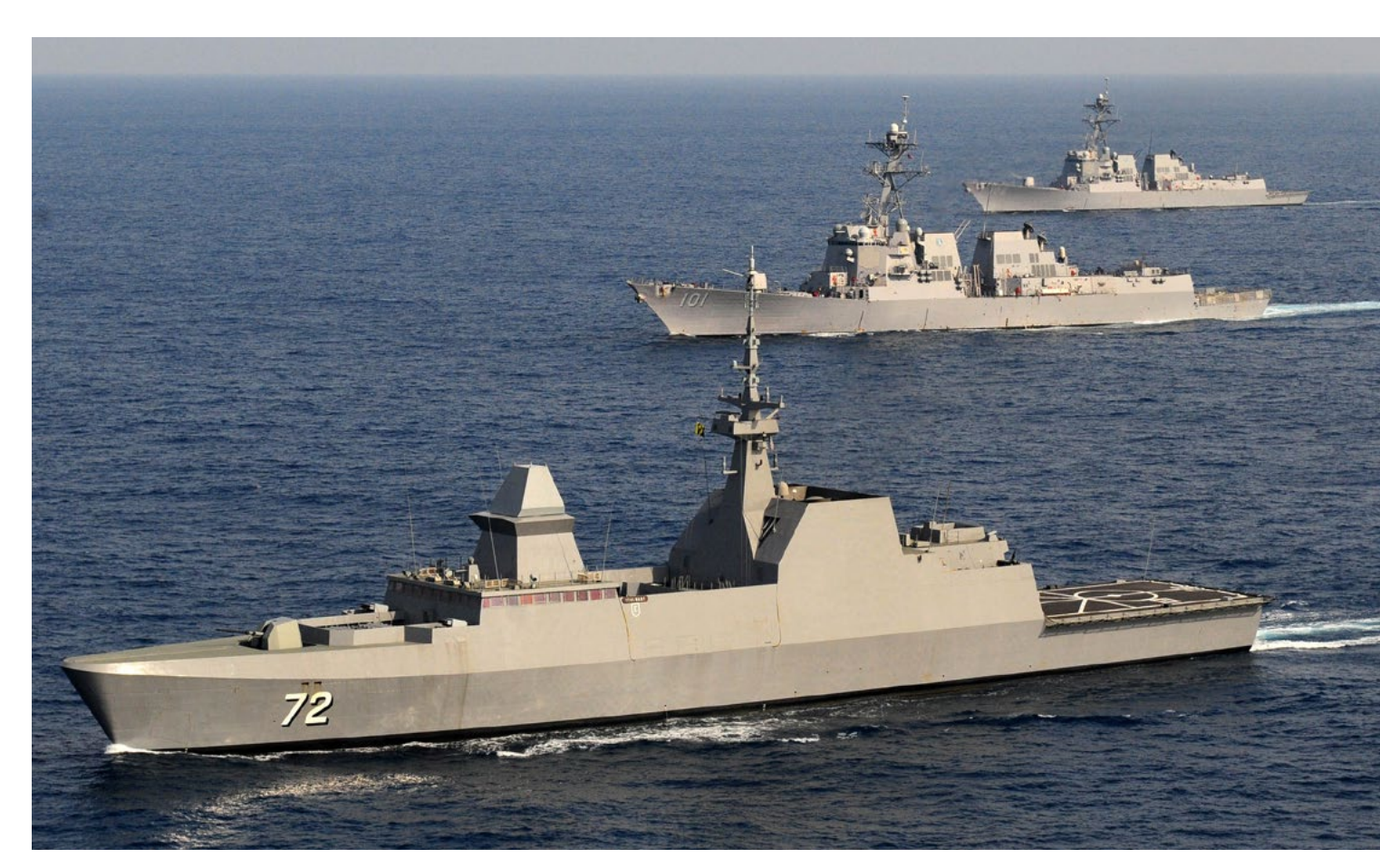
In 2012 the Republic of Singapore Navy frigate RSS Stalwart deployed alongside U.S. guided-missile destroyers USS Gridley (center) and USS Stockdale (far right).

• Set Up a Big-Data Task Force: The secretary of defense, in partnership with the State Department's Bureau of Political-Military Affairs and Office of Global Partnerships, should convene a task force of technology company and NGO representatives to brainstorm how commercial-sector solutions can enhance maritime awareness in the South China Sea in support of the cooperative mission threads identified in this paper: IUU fishing, the transnational crime complex, and HA/DR.