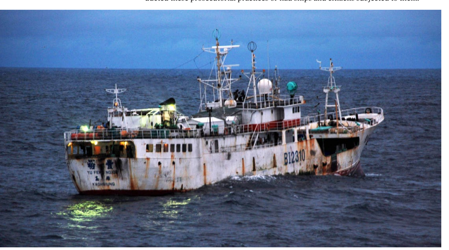
The Taiwanese-flagged fishing vessel Yu Feng shortly before being boarded by law enforcement on suspicion of illegal fishing in 2009.

Governments across Southeast Asia have signaled an appetite to combat the epidemic of illegal fishing. In 2007, 11 Southeast Asian and Pacific Island nations – Australia, Brunei Darussalam, Cambodia, Indonesia, Malaysia, Papua New Guinea, the Philippines, Singapore, Thailand, Timor-Leste, and Vietnam – signed the Regional Plan of Action to Promote Responsible Fishing Practices (RPOA). This agreement commits governments to jointly ending IUU fishing and coordinating best practices of fisheries conservation, though most signatories face challenges with governmental capacity to monitor and enforce it.<sup>25</sup> And although it can raise the ire of neighbors, Asian states have adopted certain deterrent practices. Not only have Southeast Asian governments begun prosecuting illegal fishing crews even when hailing from other countries, but they have also started a practice of burning or blowing up the captured ships.<sup>26</sup> Thailand, Vietnam, Malaysia, Indonesia, China, and the Philippines have all either conducted these prosecutorial practices or had ships and citizens subjected to them.