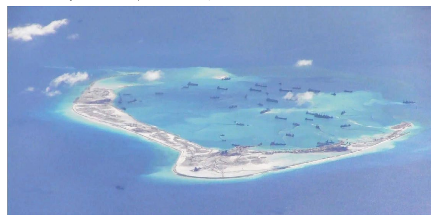
Surveillance video from a U.S. Navy P-8A Poseidon as it flies over Chinese island building efforts in the South China Sea in May 2015.

Between early 2014 and mid-2015, Beijing converted seven formerly submerged reefs and rocks into artificial islands using commercial dredging techniques. China has since begun installing military facilities and equipment on these islands. This includes sophisticated radar and communications equipment, high-capacity port facilities, and as many as three 3,000-meter airstrips, all of which are capable of landing any military aircraft that China possesses. Admittedly, China is not the only South China Sea claim-