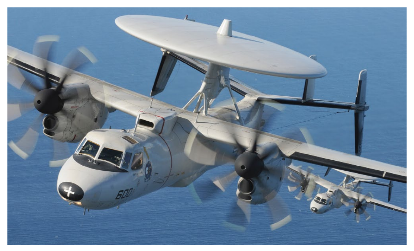
Early warning ISR capabilities, such as those provided by this E-2C Hawkeye operating over the Pacific Ocean, are still lacking among many Southeast Asian countries.

As the Pentagon's Asia-Pacific Maritime Security Strategy advertises, the United States is already doing much to improve the maritime awareness capacity of select Southeast Asian countries. The United States has aided Malaysia with coastal surveillance radar stations. It is providing assistance constructing the Philippines Coast Watch System. It is transferring a number of small patrol vessels to the Philippines. And it is supporting Indonesia's effort to enhance MDA through a number of activities. But these efforts are a pittance compared with what is needed for actionable situational awareness. Most maritime Southeast Asian militaries still lack aerial reconnaissance, rudimentary electronic warfare and signals intelligence, and airborne early warning capabilities; all have only limited maritime patrol and reconnaissance capacity. Current U.S. efforts improve regional capability only on the margins.