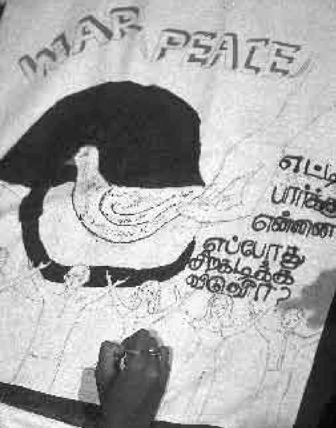
Mural workshop at “Kids in touch” Conference and Workshops, Kundasale, Kandy, Sri Lanka.