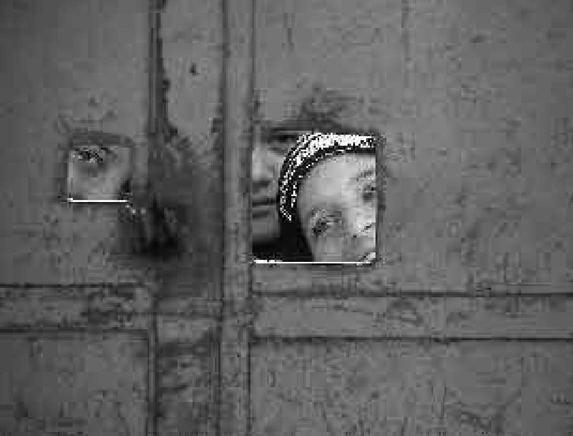
Children peering through hole in gate, Shati Refugee Camp, Gaza, Occupied Palestinian Territories.