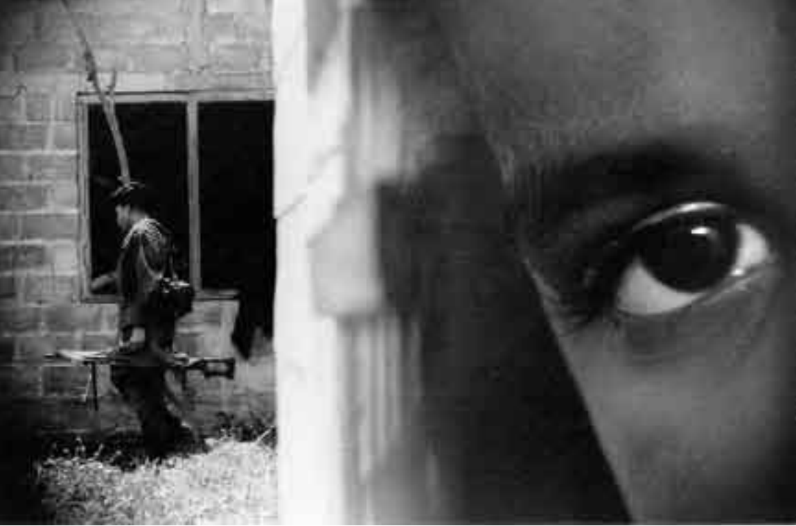
Las otras huellas de la guerra (The hidden traces of war project), Colombia