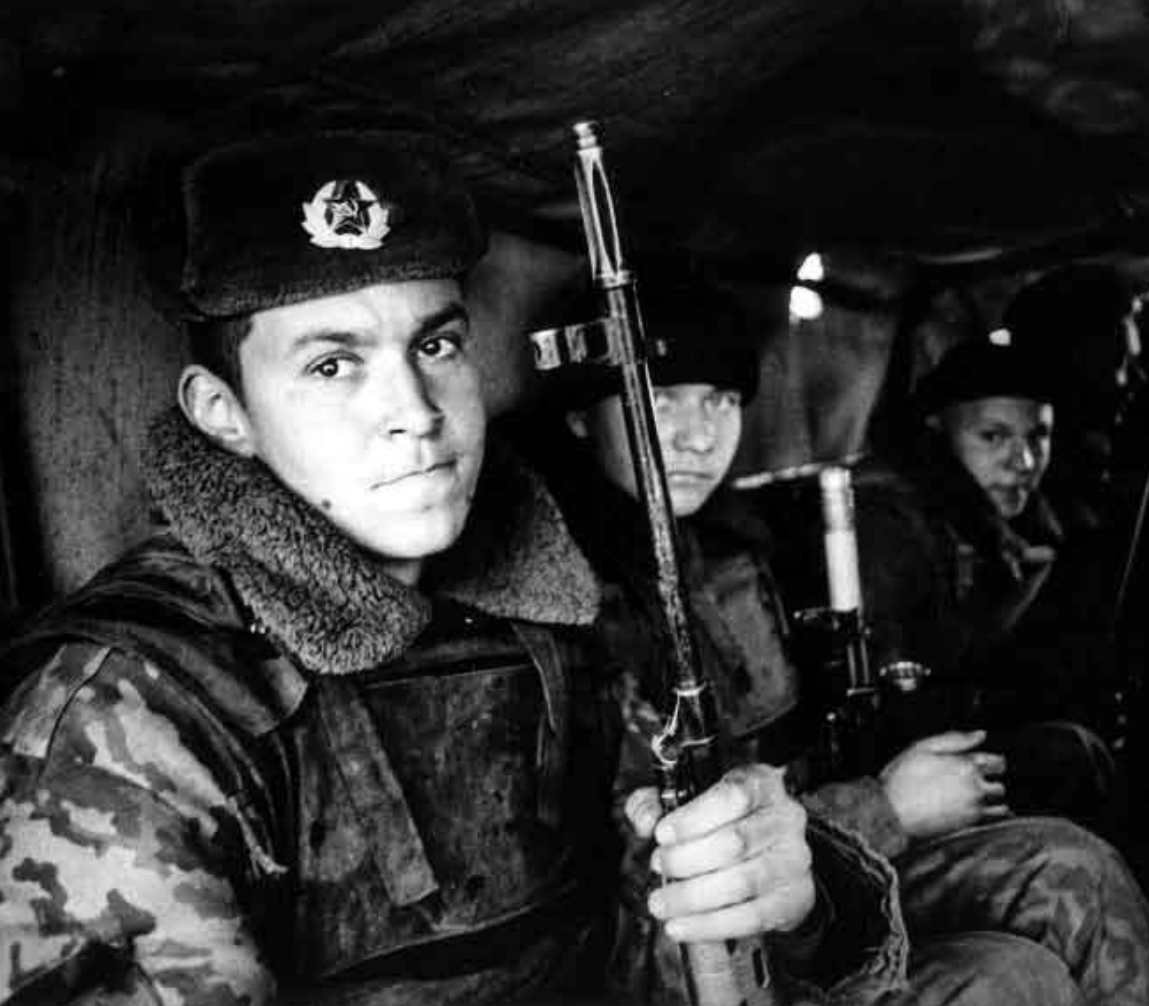
Young conscript in army truck just before his unit leaves for Grozny, capital of the Chechen Republic, at the beginning of the Russian offensive to retake the city in 2000.