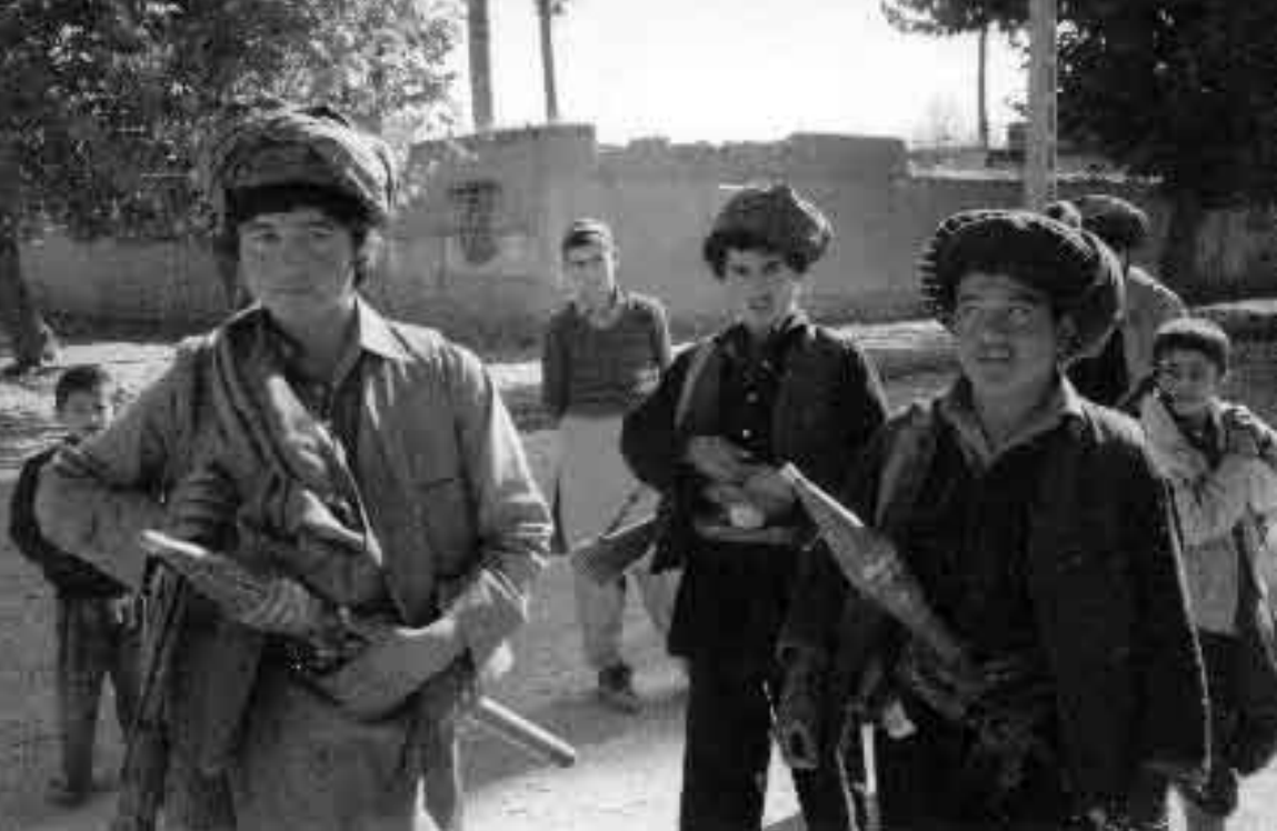
Taliban child soldiers, Afghanistan