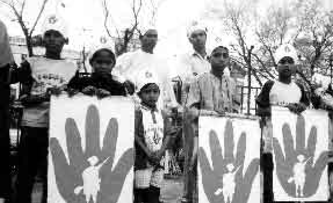
The Bangladesh Coalition for Child Rights sponsored rallies in front of the National Parliament House and the National Press Club on 12 February 2002 to mark the coming into force of the Optional Protocol.