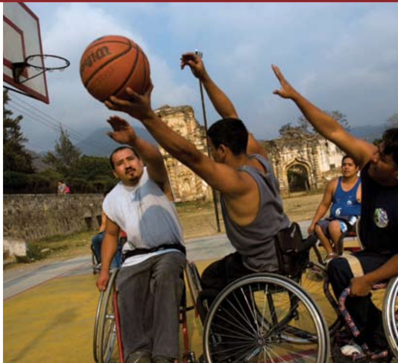
A game of basketball in La Antigua, Guatemala, April 2006. ‘Fundación Transiciones’ is an NGO that helps people with disabilities become confident and proactive ‘survivors’. About 20% of Transiciones’ ‘client base’ is disabled due to gunshot wounds—as a result of gang violence, civil war, and accidents.

—Indonesia statement at January 2006 PrepCom 4