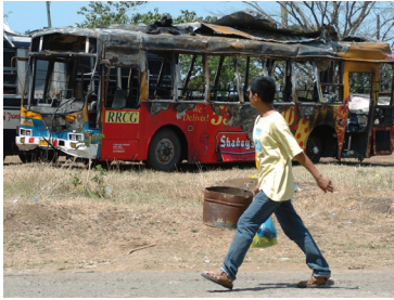
A boy walks past the wreckage of a bus charred during the February 14 bombing in Manila. There were also terrorist attacks that day in Davao and General Santos City.

These bombings also used more technically sophisticated explosive devices, another cause for concern. The RSM, composed of Christian converts to Islam, has the ability to blend in and move freely about Luzon and other urban areas of the Philippines. The Philippines experienced another domestic terrorist attack in August when a bomb exploded aboard the Dona Rosa passenger ferry in Basilan, injuring 30 people, four of whom subsequently died.