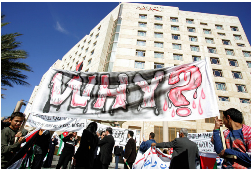
Jordanians demonstrate to condemn the triple suicide bombings against Jordanian hotels in Amman in November.

The Jordanian Government aggressively pursued the network of fugitive Jordanian terrorist Abu Musab al-Zarqawi, believed responsible for attacks in Jordan and Iraq, including the November 9 bombing of three hotels in Amman that killed 63 people and the August 19 rocket attack in Aqaba that also impacted Eilat, Israel. Jordan publicly condemned terrorist acts throughout the world, introduced heightened security measures, and began drafting new