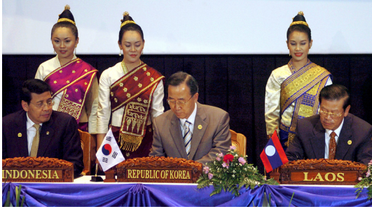
South Korean Foreign Minister Ban Ki-Moon (center) and his Lao counterpart Somsavat Lengsavad (right) sign a joint declaration to combat international terrorism during a meeting of the Association of Southeast Asian Nations (ASEAN) in Vientiane in July, while Indonesian Foreign Minister Hassan Wirajuda (left) serves as a witness.

levels see terrorism as an issue of only marginal relevance to Laos; they believe that Laos, as a small and neutral country, would not be targeted by international terrorists.