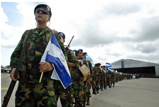
Salvadoran soldiers of the Cuscatlan Battalion board a military plane headed for Iraq in August. El Salvador is the only Latin American country with troops in Iraq.

El Salvador backed its outspoken support for the United States-led coalition in the global war on terror by sending a fifth troop rotation to Iraq in August.