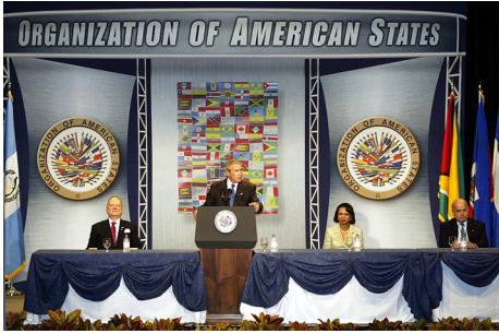
President George W. Bush speaks at the Organization of American States' (OAS) 35th General Assembly in Fort Lauderdale, Florida, in June as OAS Secretary General Jose Miguel Insulza (right), U.S. Secretary of State Condoleezza Rice (second from right), and Assistant Secretary General of the OAS Luigi Einaudi (left) look on.

A continuing positive trend in the Western Hemisphere was the increased political will to address terrorism. Although counterterrorism capacity and expertise remain lacking in many states in the hemisphere, countries continued efforts to strengthen their counterterrorism regimes on all fronts, with an emphasis on cooperation.