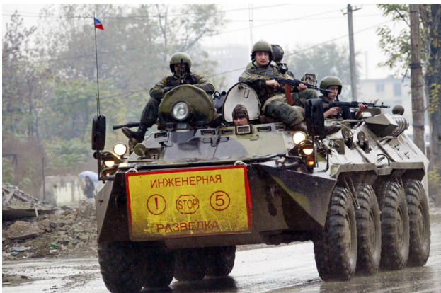
A Russian army armored personnel carrier patrols a street of Grozny in October after a roadside blast targeted their convoy in the center of the Chechen capital.

In the face of new terrorist attacks on Russian soil, the Russian Government and public continued to view counterterrorism as a top priority. Much of the terrorist activity in the region and elsewhere in Russia was homegrown and linked to the Chechen separatist movement, although there was evidence of a foreign terrorist presence in Chechnya and of international financial and ideological ties with Chechen groups. Russia claimed a success in March with the slaying of Chechen separatist leader Aslan Maskhadov; its assertions that the insurgency was terrorist in nature were bolstered by the addition in August of the terrorist Shamil Basayev to the