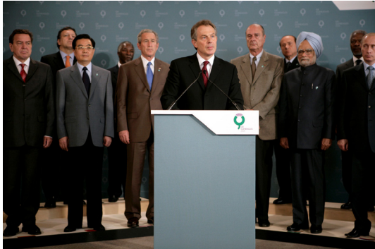
President George W. Bush and fellow G8 leaders stand behind British Prime Minister Tony Blair as he addresses the media on July 7, regarding the terrorist attacks in London earlier in the day.

The Group of Eight (G8) -- the United States, Canada, France, Germany, Italy, Japan, Russia, and the United Kingdom -- was instrumental in developing cutting-edge counterterrorism standards and practices. These included enhanced travel document security standards, as well as strengthened controls over exports and stockpile security to mitigate the threat to airports from illicit acquisition of shoulder-fired anti-aircraft missiles (man portable air defense systems, or MANPADS).