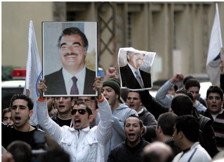
Following the February 14 assassination of former Lebanese Prime Minister Rafiq Hariri and 22 others, his supporters demonstrate in Beirut. Hariri was killed in a huge explosion in central Beirut.

In April, Syrian military forces and overt intelligence agents departed Lebanon after 29 years of occupation. Terrorist activities were still carried out in Lebanon, however. Israeli positions in the Blue Line village of Ghajjar in the Israeli-occupied Golan region were attacked on November 21, probably by Hizballah. Al-Qaida in Iraq claimed responsibility for a rocket attack on Israel from Lebanese territory on December 27, but some analysts suspected “rejectionist” Palestinian groups or Hizballah as the perpetrator and, thus far, a clear determination of culpability has not been possible. Throughout the year, Hizballah continued to claim the right to conduct hostile operations along the Blue Line on the premise of a legitimate “resistance” to the occupation of Lebanese territory.