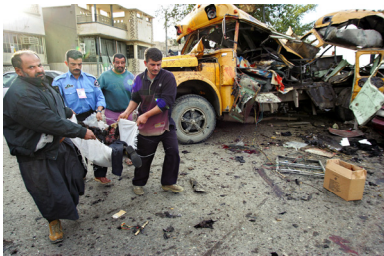
Iraqis carry the body of a young girl who was killed in a combined mortar attack and suicide bombing in an apparent strike against Iraqi Muslim Shiites returning from commemorating Ashura, a holy day of the Shiite Muslim year, in February.

Iraq remains a key front in the global war on terror; US, Coalition, and Iraqi forces are engaging international terrorists as part of the security mission mandated by UNSCR 1546 and 1637 in support of the democratically-elected Iraqi government.