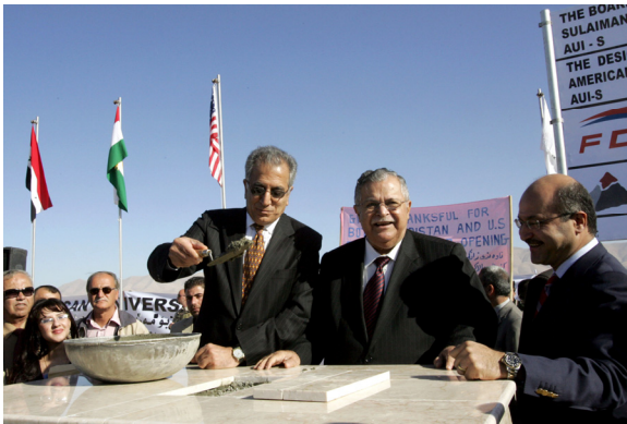
Iraqi President Jalal Talabani (center), U.S. Ambassador Zalmay Khalilzad (left), and Minister of Planning Barham Saleh lay the cornerstone of the American University in Suleimaniya at a ceremony in the northern Kurdish city of Suleimaniya.

Public diplomacy is essential to a successful foreign policy and to America's national security. The United States recognizes that the global and generational challenge of countering terrorism is, at its heart, a contest of ideas and values, and that America is more secure when people around the world share the same hopes and freedoms.