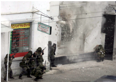
Members of Russian special armed forces storm a shop in the southern city of Nalchik on October 14, where gunmen were hiding following a deadly rampage the previous day.