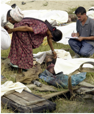
A Nepalese woman tries to identify a relative after a bomb ripped through a passenger bus in Kalyanpur in June. The incident was the worst attack targeting civilians since the beginning of the Maoist insurgency.

Nepal's primary focus remained the Maoist insurgency, active in Nepal since February 1996. In 2005 alone, Maoists were responsible for the deaths of at least 263 civilians and 330 government security forces, according to press accounts. The government reports that Nepalese security forces arrested thousands of suspected Maoist militants and killed more than 966 in 2005.