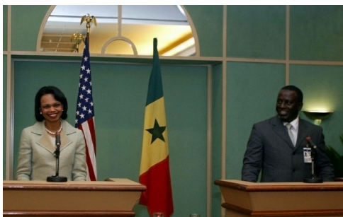
Secretary Rice and Senegalese Foreign Minister Cheikh Tidiane Gadio during a joint press conference at the U.S.-Sub Saharan Africa Trade and Economic Cooperation Forum (AGOA) in Dakar in July.

The Government of Senegal's law enforcement and intelligence entities responded appropriately to all perceived terrorism threats, and shared information with U.S. counterparts. Senegal's continued support of the global war on terror has furthered Senegal's reputation as an example of political and religious moderation in the Muslim world.