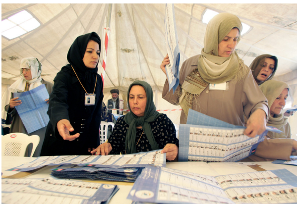
Afghan women count ballot papers in Herat following the country's September parliamentary elections, Afghanistan's first free elections in more than 30 years.

Hamid Karzai, President of the Islamic Republic of Afghanistan Afghanistan Development Forum April 4, 2005