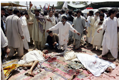
Pakistani Muslim devotees grieve after a suicide bomber blew himself up in the middle of a shrine in Islamabad, killing more than a dozen people in May.

Despite these successes, al-Qaida and Taliban operations in Pakistan continue to pose a threat to U.S. interests, and tribal support for operations against al-Qaida and the Taliban is mixed.