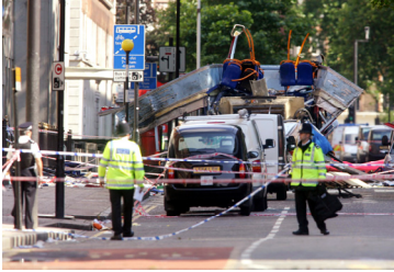
Police officers stand in front of a sealed off area around a bus in London after the July 7 terrorist attacks.

London suffered terrorist attacks on July 7 and July 21. The July 7 attacks were carried out by four suicide bombers who detonated their bombs on the London public transportation system, three in the Underground and one on a city bus. Fifty-six people, including the terrorists, were killed in the July 7 attacks and more than 700 were injured. Three of the bombers were UK-born citizens of Pakistani descent; the other was a British national of Jamaican descent and a convert to Islam. A video of one of the bombers, Mohammed Siddique Khan, was released through the media after the attacks, and in that video Khan attributed his act of violence to anger over UK foreign policy.