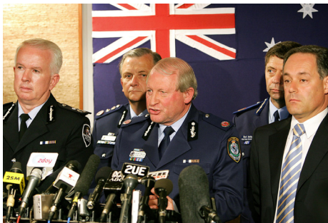
Australian police officials speak at a press conference in Sydney in November after foiling what they described as a "large-scale terrorist attack" in Sydney and Melbourne. Officers arrested more than a dozen suspected terrorists.

Australia launched substantial initiatives and worked with its regional neighbors to assist in building their resolve and capacity to confront terrorism. In November, Australian police arrested 18 suspected terrorists in Sydney and Melbourne, disrupting a potential terrorist attack on Australian soil. Australia enacted comprehensive counterterrorism legislation in December, enhancing the ability of law enforcement and intelligence agencies to detect, detain, and prosecute suspected terrorists. The legislation featured new regimes for "preventative detention" of persons to prevent an imminent terrorist act as well as preserve evidence of a terrorist attack, and "control orders" that would allow the close monitoring of persons believed