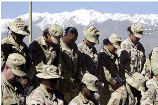
U.S. soldiers silently pay their respects to fallen comrades killed in a helicopter crash in Afghanistan.

Afghanistan continued its progress toward building a democratic government, holding National Assembly and provincial council elections in September. In spite of Taliban threats to disrupt the democratic process, only minor incidents occurred, and the election results were accepted as legitimate by the Afghan people. The National Assembly was inaugurated December 19, marking the final milestone of the Bonn Process.