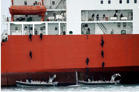
Singapore Armed Forces commandos board a vessel during a simulated exercise off the Singapore Straits in March 2005.

Singapore Phase Three, a program that evaluates vulnerabilities in maritime trade lanes that could allow entry of weapons of mass destruction, contraband, or illegal immigrants into U.S. ports. In September, Singapore, Indonesia, and Malaysia launched an "Eyes in the Sky" initiative, whereby the three nations will conduct combined maritime air patrols over the Straits of Malacca and Singapore.