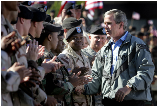
President George W. Bush shakes hands with troops after making remarks on the War on Terror before some 25,000 service members in April at Fort Hood in Killeen, Texas.

Iraq remains a key front in the global war on terror. US, Coalition, and Iraqi forces are engaging international terrorists as part of the security mission mandated by UNSCR 1546 and 1637 in support of the democratically-elected Iraqi government.