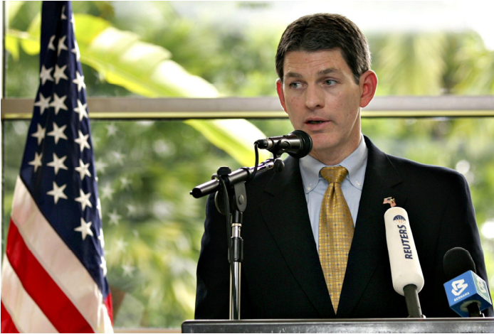
Ambassador Henry A. Crumpton, State Department Coordinator for Counterterrorism, holds a press conference in Putrajaya, Malaysia, in October.

As set forth in the President's February 2003 National Strategy for Combating Terrorism, the Department of State is responsible for developing coordinated strategies to defeat terrorists abroad. These strategies recognize that in today's increasingly interconnected world, it is impossible to draw neat, clear lines between security interests, development efforts, and U.S. support for democracy. The United States must use all of the instruments of statecraft to integrate and advance these goals.