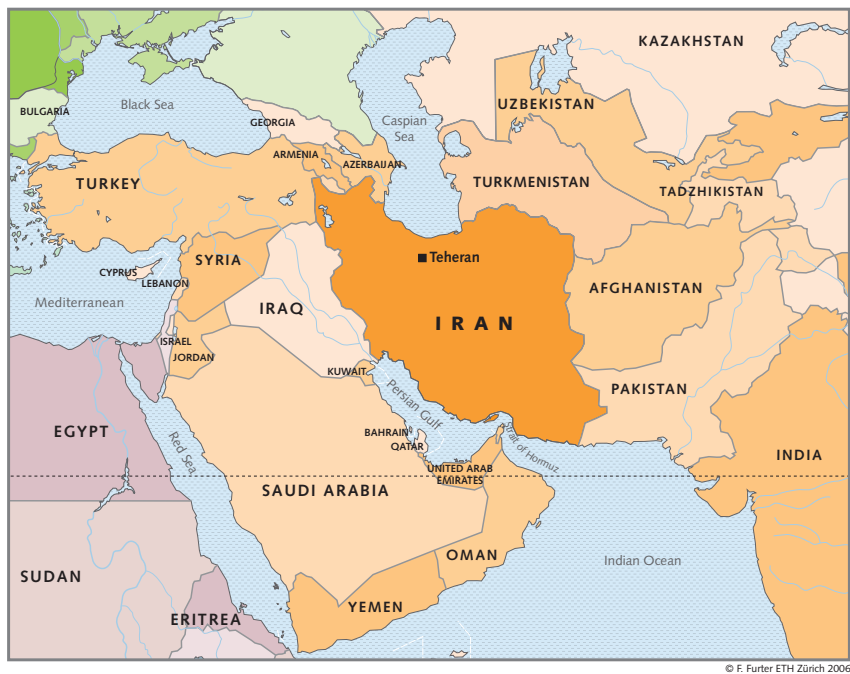
Iran and its neighbors

Moreover, even if some form of rapprochement based on shared interests came about, defusing the nuclear crisis in a sustainable manner would also require the