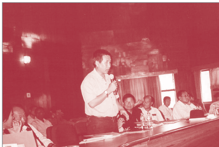
Geneva Call 2005

February 2006, a second mine ban workshop, which was attended by the NSCN-IM and representatives of the political wing of another NSA, was organized in Assam State. 195 In addition, the NSCN-IM has stated that it has advocated the need for a mine ban to other NSAs in the region. Five of these have shown an interest in discussing the issue and have expressed a willingness to move towards a total ban of AP mines. 196