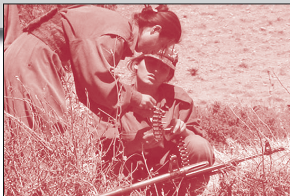
Women combatants of the People's Defense Forces

Volume I defined an NSA as any armed actor with a basic structure of command operating outside state control that uses force to achieve its political or allegedly political objectives. 33 Such actors include rebel groups and governments of entities which are not (or not widely) recognized as states. 34 It is apparent that NSAs (also called non-state armed groups or simply armed groups) are very diverse. Some of these groups may have clearly defined political objectives, while this may be less clear-cut in other cases. Some NSAs may control territory and have established administrative structures parallel to those of the state, while others have loose command structures and weak control over their members. Some concentrate their forces on attacking military targets, while others attack civilians. They can be composed of men, women, and children. In some groups, female members are estimated to comprise one-fifth or even one-third of the recruits to the group's combatants and other members. 35 Members of these groups may have been recruited voluntarily or forcefully. Certain NSAs allegedly even provide services that aim at protecting the human security needs of their members, such as "social or psycho-sociological needs." 36 Mine action can also be such a service.