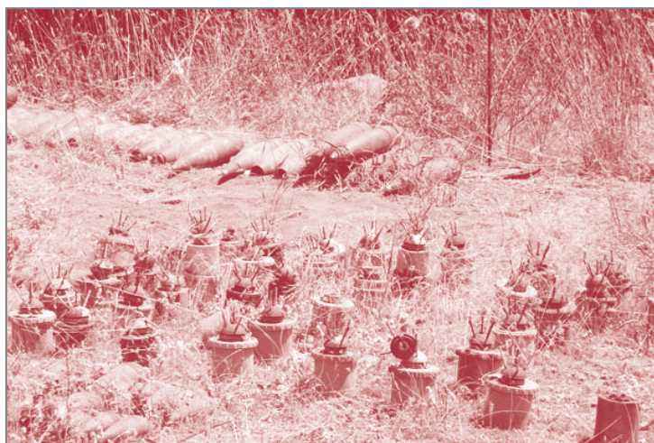
Geneva Call 2006

There have been reports (from 1999) of one case in which the HPG unilaterally informed a mine action operator (tasked to remove booby-traps placed by the HPG) of the number of devices there were. 406