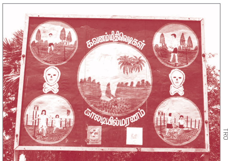
Sign by TRO and UNICEF warning for the dangers of landmines

There are several national and international MRE NGOs operating in Sri Lanka. White Pigeon (a sub-organization of the TRO) is one of the local NGOs with which UNICEF is implementing major MRE programs. 476 Three main operators work in all contaminated areas: (i) UNICEF 477 (in cooperation with UNDP Mine Action); (ii) White Pigeon; and (iii) Sarvodaya. 478 In the Vanni region, which is controlled by the LTTE, MRE is undertaken by White Pigeon and MAG, working closely with HDU. 479 Other substantial contributions come from local NGOs such as the Community Trust Fund and the Tamil Refugee Rehabilitation Organization. 480 MRE strategies have included community-based initiatives, mass media campaigns and school-based programs. Community liaison work is also undertaken, 481 especially by MAG.