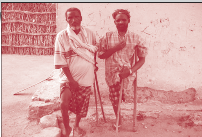
Survivors, Somalia, May 2005

Due to the disastrous humanitarian and socio-economic consequences of landmines, currently 151 of the world's states have acceded to the 1997 Mine Ban Treaty (also known as the "Ottawa Treaty"). 7 Despite this significant step in the fight against landmines, and the considerable efforts of humanitarian mine action agencies, seven years after the entry into force of the Mine Ban Treaty, landmines and UXO continue to constitute an acute problem threatening human security in numerous countries and territories. 8 One of the important challenges facing a global mine ban is the inclusion of NSAs in the process. This was the rationale behind the launching of the NGO Geneva Call shortly after the coming into force of the Mine Ban Treaty: engaging NSAs in the AP mine ban and in other mine action activities. Geneva Call proposes that NSAs sign a "Deed of Commitment under Geneva Call for Adherence to a Total Ban on Anti-Personnel Mines and Cooperation in Mine Action" (hereafter "Deed of Commitment"). To date, 31 NSAs have signed the Deed of Commitment.