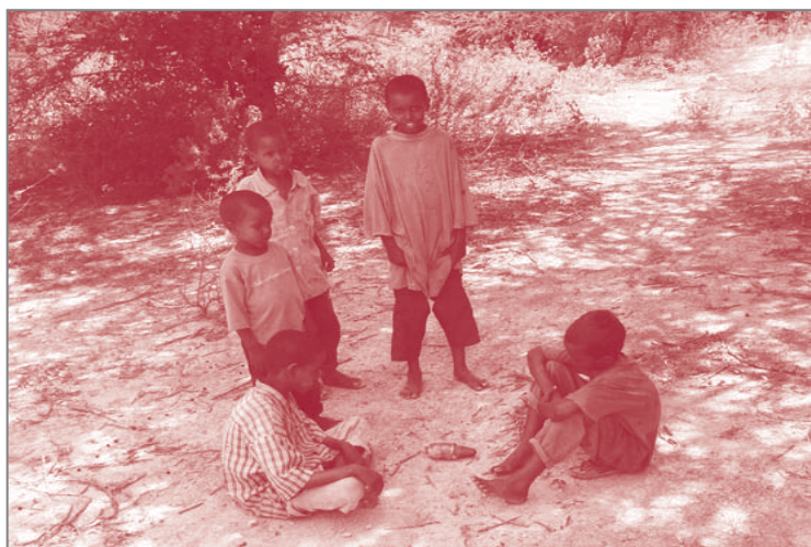
Geneva Call 2005

Children fascinated by UXO, Bardale district, Bay province, Somalia, May 2005