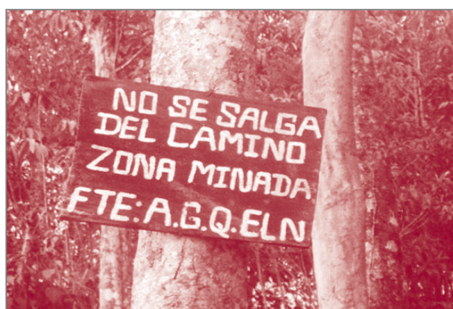
Colombian Campaign Against Mines

Members of the ELN who are responsible for producing and placing landmines are also believed to deal with the removal of mines. However, the ELN appears to possess little knowledge of international standards for mine action. Female combatants are reportedly involved in both handling explosives and mine action (e.g. marking and informing about the presence of mines). 37