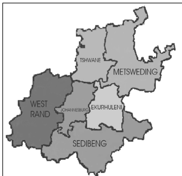
Figure 1: Municipalities of Gauteng province

A brief overview of Gauteng is provided in order to locate the particularities of the Johannesburg Metropolitan Municipality (see figure 1). Gauteng is the smallest of South Africa's nine provinces, covering 17,010 square kilometres or 1 per cent of total land area.