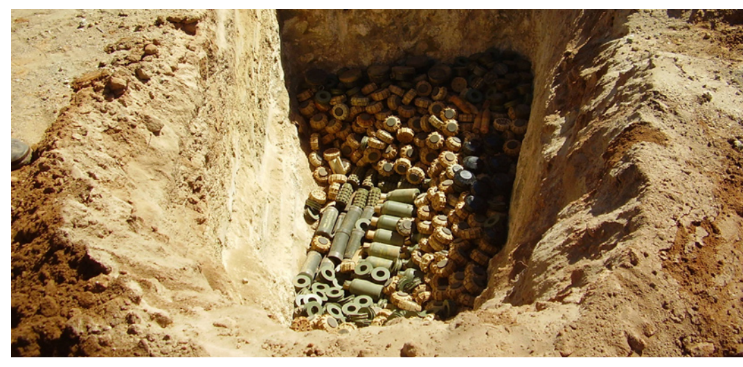
Mines belonging to an NSA, prepared for destruction.

The chapter that follows discusses how the findings here summarized could apply to other issues that constitute human security threats, exemplified by the issues of child soldiers and small arms and light weapons.