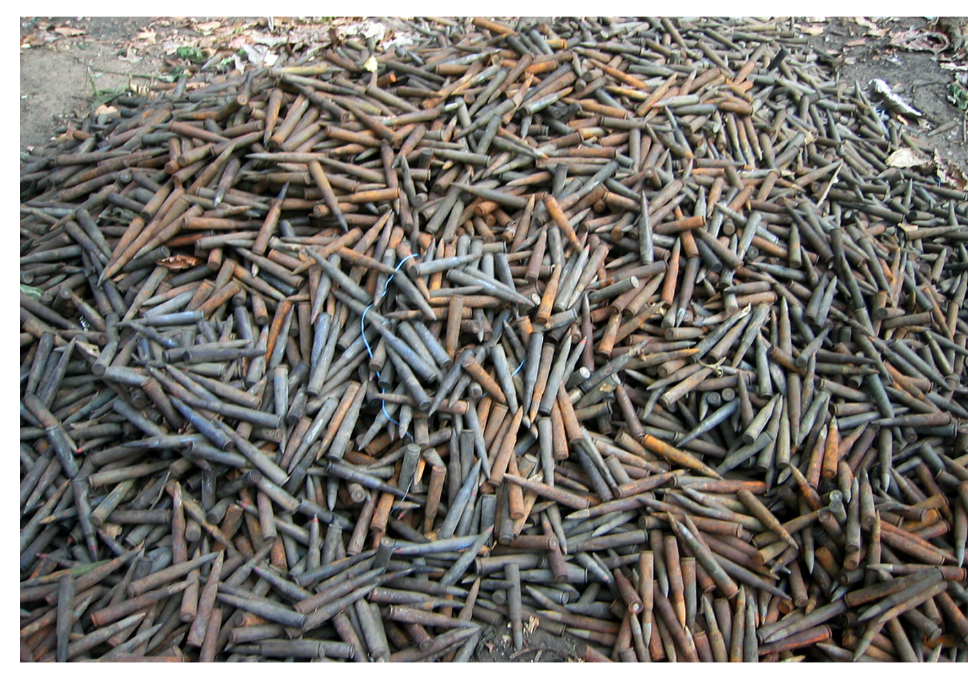
Ammunition rounds, South Sudan.

In this chapter, it has been shown that some of the findings from the NSAs and landmines project could also be useful for the study of NSA involvement in the small arms problem, both in negative (misuse) and positive (measures taken to improve protection or decrease misuse) terms. The following chapter summarizes the main findings of the report and presents some recommendations elaborated to improve mine action efforts with NSAs.