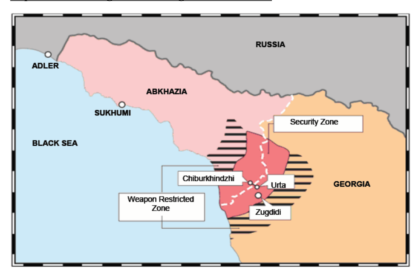
Map 2 - Peacemaking Zone on Georgian-Abkhaz Border<sup>40</sup>

in pink and the weapons restricted zone marked by black horizontal stripes. The overall measurement of both zones is 85 km in length and 24 km in width along the border.<sup>39</sup>