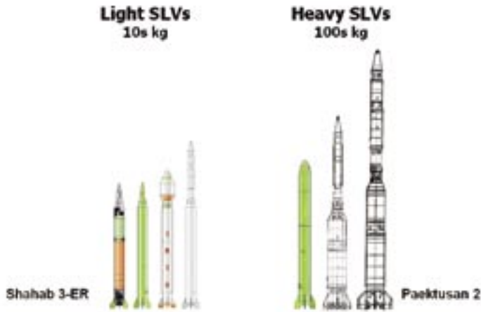
Figure 9. Notional modeling of Iran's prospective SLV families (credit for light SLV modeling: Mark Wade, Encyclopedia Astronautica)

The heavier, workhorse-type of SLV is more demanding. Iran could buy the alleged North Korean Paektusan (Taepo Dong) 2 heavier SLV, if it really exists. Alternatively, Iran could emulate Saddam Hussein's rocket engineers by clustering several Shahab 3 rockets into a heavy first stage, use a single Shahab 3 as a second stage, and top it with a small solid propellant motor as a third stage. 5 It is, however, more likely that the workhorse SLV will be based on Iran's emerging solid propellant capability. The hint in this direction came from Shamkhani's 2000 information on an SLV with a solid propellant second stage. An all-solid propellant, three-stage SLV with the diameter of the Shahab 3 would yield a very effective launch vehicle. It would have no problem in orbiting several hundred kg spy satellites from Qom or an equivalent spaceport within Iran, with none of its spent stages endangering inhabited areas. A two-stage version of this SLV could make a very capable long range ballistic missile that could reach all the way from Iran to the Atlantic Ocean. A three-stage ballistic missile based on this SLV could put a warhead on any point in the US.