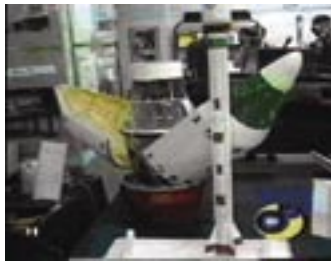
Figure 7. Models of an Iranian indigenous space launch vehicle and a reconnaissance satellite, March 1998

Iran announced its intention of becoming a spacefaring nation almost as soon as it unveiled the Shahab 3 missile. In a televised visit of Iran's supreme leader Ali Khamenei to an Iranian arms exposition in 1998, the cameras recorded a scale model of an SLV (Space Launch Vehicle) with a bulbous nose fairing. Nearby stood a model of a satellite of uncertain provenance (figure 7). The multi-stage SLV had the initials IRIS painted on its sides and was clearly related to the Shahab missile. Analyzing the images, Israeli experts concluded that the IRIS was most probably a "theme SLV" and not a practical design, since its lifting capabilities were calculated to be miniscule.