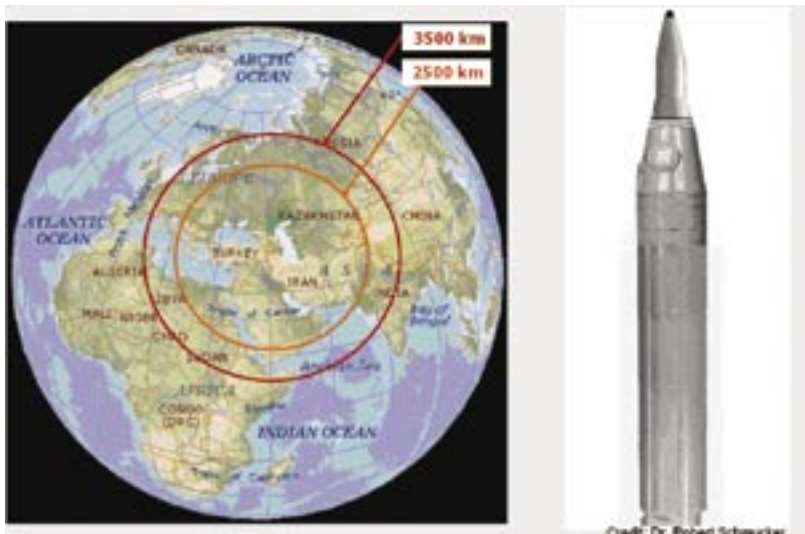
Figure 6. The BM25 (land mobile version of the Soviet SSN6 SLBM) and its range from eastern Iran according to Israeli and German sources (BM25 modeling courtesy of Dr. Robert Schmucker)

In January 2006, a German newspaper revealed the transfer of a new type of missile from North Korea to Iran, dubbed BM25 and having a range of 3500 km. The transfer of the new missiles to Iran was subsequently confirmed by Israel's chief of military intelligence, General Amos Yadlin, although the attributed range in his statement was 2500 km. The missile is reported to be a land based, extended range version of the venerable Soviet era SSN6 SLBM (figure 6). According to the reports, eighteen of those missiles with their launchers were purchased from North Korea. The Iranian government denied the