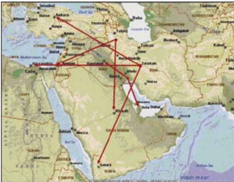
Figure 3. Iran's Shahab missile power projection from hardened fixed sites (site locations are notional)

the southern narrows of the Red Sea are within range of the Shahab family of missiles. Even more significant, Iranian ballistic missiles can now cover the entire area of the Middle East from fixed sites deep within Iran's borders. The importance of this capability cannot be overemphasized. All the Shahab variants are designed to be transported by and fired from land mobile launchers. The survivability of land mobile missiles is based on their mobility, which permits them to travel from their launch sites into hiding places shortly after firing off their missiles. This is how Saddam's missileers evaded the US air assets sent to destroy their launchers during the 1991 Gulf War. Yet land mobility carries its own risks to survivability: if provided with timely intelligence, the attacker can theoretically intercept and destroy land mobile launchers when they are on the move for operational or logistics purposes. Hence, suitably hardened fixed sites were preferred by both superpowers as the chief (and in the case of the US, the exclusive) basing mode of the core of their ground based ICBMs. There are indications that the Iranians are now following suit.