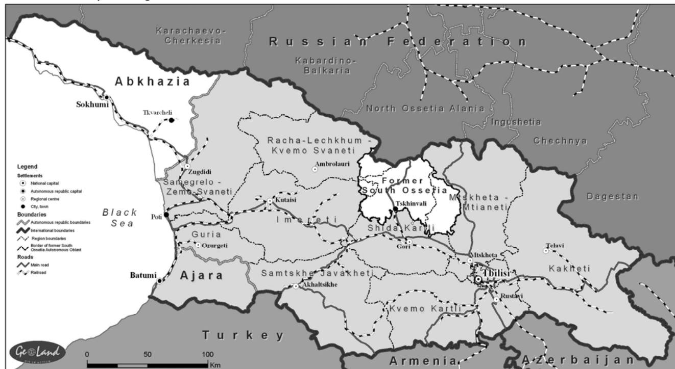
Administrative map of Georgia