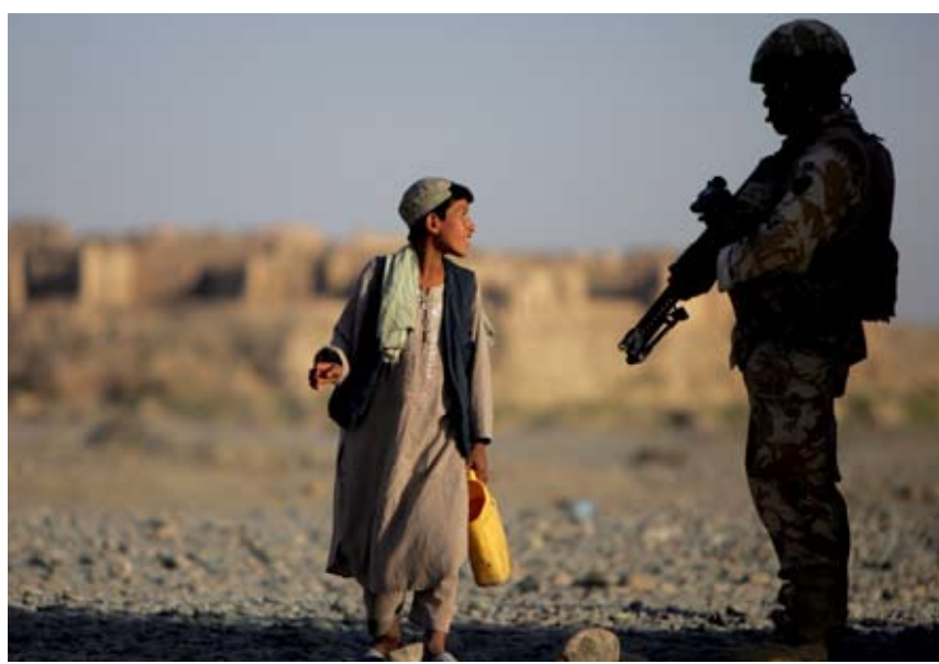
Encounter between Afghan boy and British soldier

Security and development are increasingly regarded as overlapping policy fields. While their goals may intersect in view of the links between poverty, violent conflict, weak states, and terrorist challenges, they are not always congruent. The political challenge is increasingly to coordinate strategies and measures of security policy and development policy, without placing the fight against poverty one-sidedly into the service of peacebuilding.