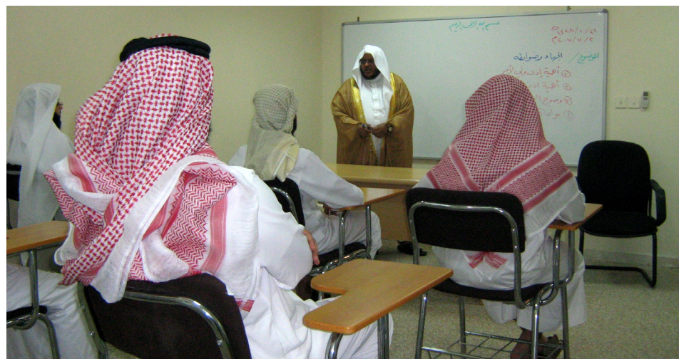
A Saudi rehabilitation class discussing the rules of jihad, just one part of the country's counter-radicalization efforts.

T HE PROMINENT ROLE of the internet in propagating and perpetuating violent Islamist ideology is well known. The speed, anonymity and connectivity of the web have contributed to its emergence as a powerful source of knowledge and inspiration; it is an unrivaled medium to facilitate propaganda, fundraising and recruitment efforts. The vast scope of information available, coupled with the absence of national boundaries, facilitates ideological cohesion and camaraderie between disparate and geographically separated networks. 1 A broad spectrum of individuals turn to the internet to seek spiritual knowledge, search for Islamist perspectives and attempt to participate in the global jihad. As such, identifying methods to short-circuit internet radicalization has