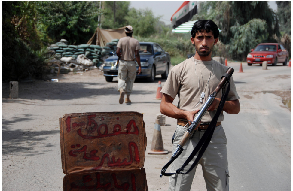
A Sons of Iraq fighter guards a checkpoint in Baghdad.

ONE OF THE MOST striking aspects of operations in Iraq during the "surge" of 2007 was the growing tribal uprising against al-Qa`ida. In late 2006 and 2007, this uprising began to transform the war. I spent considerable time on the ground throughout May and June 2007 in Baghdad and the surrounding districts working with U.S. and Iraqi units, tribal and community leaders and fighters engaged in the uprising. Listening to them talk, watching their operations and participating in planning and execution alongside American commanders supporting them provided insight into their motivations and thought processes. Moreover, during this process of participant observation I was able to gather some field data on the relationship between globally-oriented terrorists in Iraq (primarily al-Qa`ida) and the locally-focused militants who found themselves fighting as "accidental" guerrillas in the early