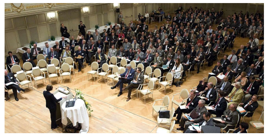
Swiss Foreign Minister Calmy-Rey at the ambassadors' conference in Berne, 25 August 2008

Several important shifts in Swiss foreign policy have been observable in recent years. With regard to the EU, the focus is no longer on the issue of accession but on consolidating the bilateral track, which allows for some economic, financial, and foreign policy niche strategies. The relative loss of importance of European policies is accompanied by a stronger appreciation of bilateral relations with extra-European centers of power and of civilian peacebuilding efforts. Maintaining the coherence of foreign policy remains a challenge. There is no domestic consensus on Switzerland's foreign policy role and priorities.