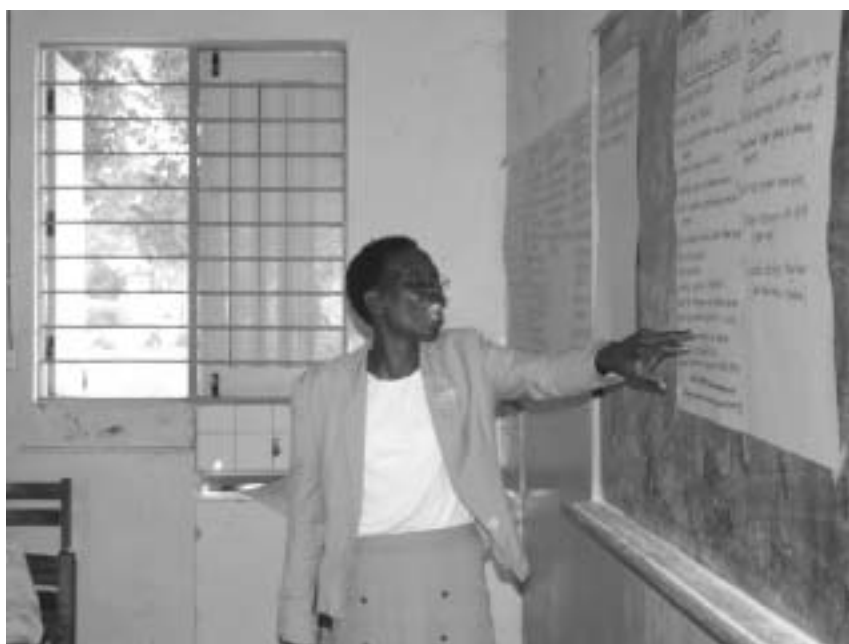
A classroom in Gulu, Northern Uganda