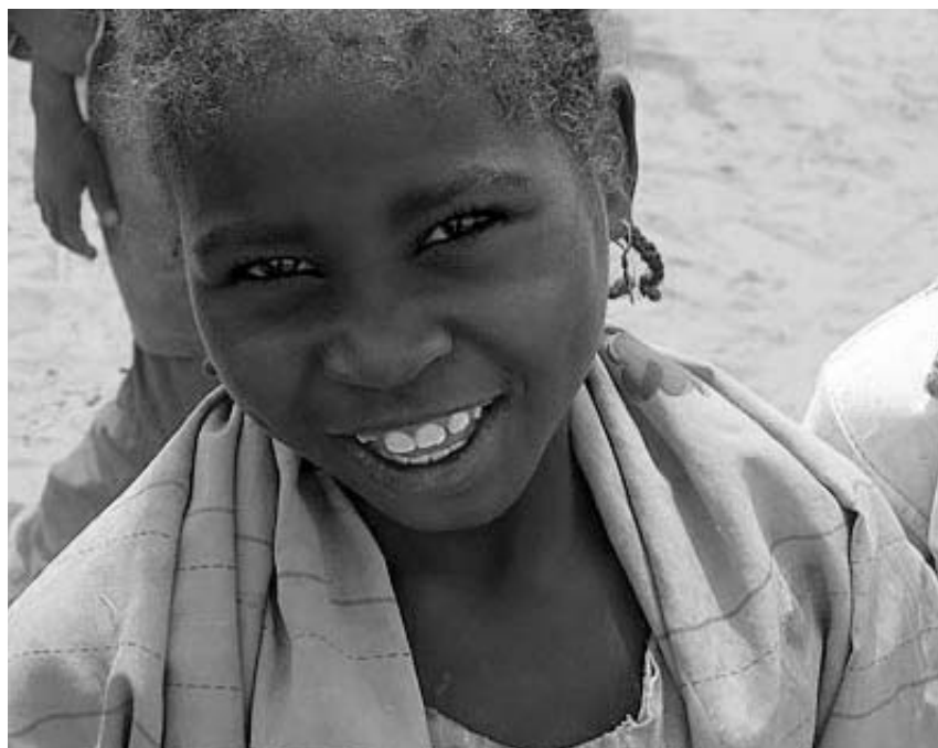
A smiling girl in Zam Zam IDP camp, North Darfur

Community Participation Standard. First, community participation is a well-accepted principle, and is part of most organisations' own standards sets. Second, it is one of the more straightforward and clear of the Minimum Standards; the corresponding guidance notes are detailed and concrete, and are arguably the easiest to operationalise. Lastly, more than three years into the conflict in Darfur, and after decades of fighting in Northern Uganda, organisations recognise the importance of community participation for the sustainability of the education programmes that they put in place.