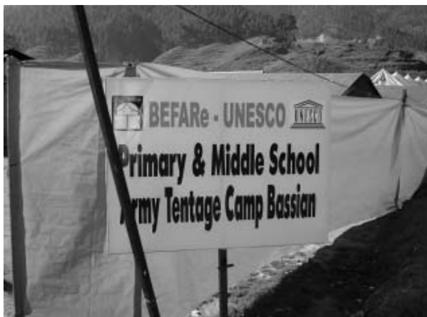
Schooling in Bisham camp, supported by the local NGO BEFAre and UNESCO

stakeholders, thus addressing community participation and coordination, the documentation and presentation of lessons learned, including the production of case studies, and promotion of, and training on, the Minimum Standards. Perhaps most importantly, the Standards have served as a checklist for the ongoing monitoring of the UNESCO ERP. The situation in the affected areas has been changing very rapidly over the past year, making it difficult to assess whether the programme has sufficiently addressed the changing needs of the affected population. According to the Analysis standards and indicators, there is still much work to be done to update assessments and priorities in consultation with communities. The INEE Minimum Standards have also helped to highlight weaknesses in