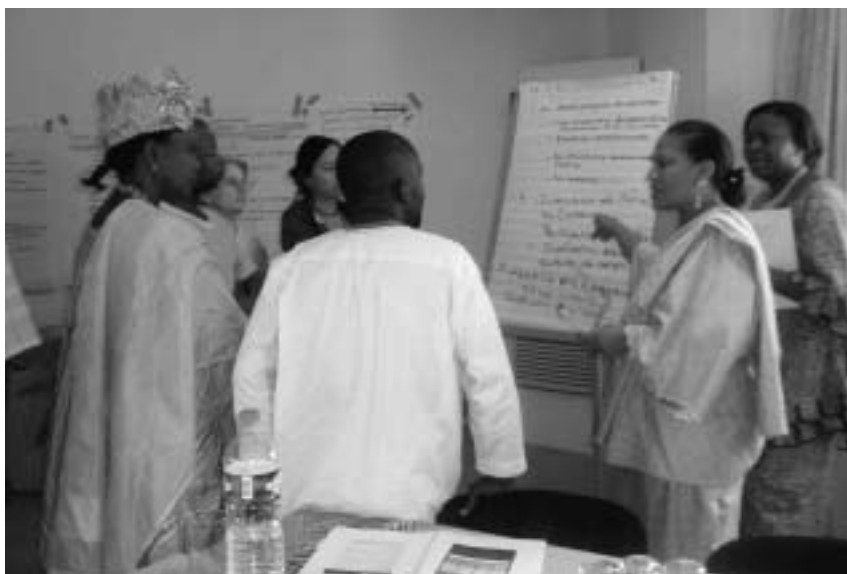
Delegates at a Training of Trainers Workshop on the INEE Minimum Standards in Dakar, Senegal

The INEE Minimum Standards were designed to be an immediate and effective tool to promote protection and quality education at the start of an emergency, while also laying a solid foundation for post-conflict and post-disaster reconstruction. The establishment of universal standards that articulate the minimum level of educational service to be attained, along with indicators and guidance notes on how to reach these standards, serve as a common starting point – a common language and framework – to enable governments and humanitarian agencies to work together to ensure that the right to education is met. They hold the humanitarian community accountable for providing essential survival and life skills information, and for establishing