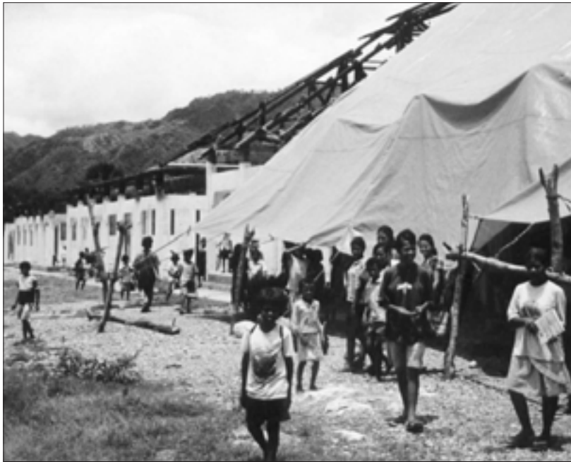
A makeshift school in East Timor

In 2002–2003, the UNESCO International Institute for Educational Planning (IIEP) and Section for Support to Countries in Crisis and Reconstruction are developing a joint programme to ‘build governments’ capacity to plan and manage education in emergencies’. Beginning with the documentation of case studies that illustrate different emergency profiles, researchers will review education responses in East Timor, Honduras, Kosovo, Palestine and Rwanda. In addition to drawing out lessons learned and producing a series of policy studies, materials will be developed to conduct training with ministries of education (Talbot, 2002). Concurrently, the UNESCO International Bureau of Education (UNESCO IBE) is undertaking a study on curriculum change and social cohesion in conflict-affected societies (Tawil and Harley, 2002). Research will take place in Bosnia-Herzegovina, Guatemala, Lebanon, Mozambique, Northern Ireland, Rwanda and Sri Lanka.