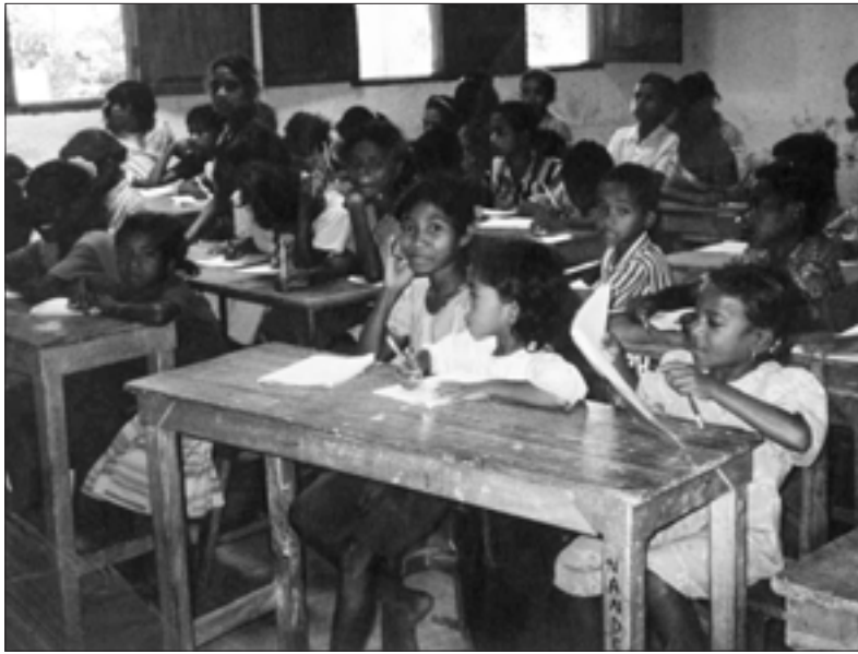
A classroom in East Timor