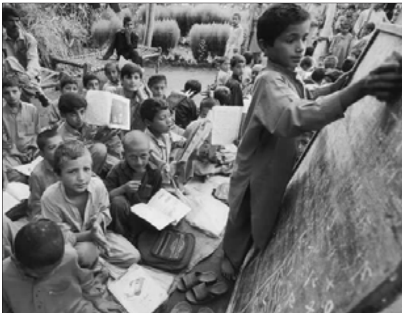
Literacy classes in an Afghan refugee camp in Pakistan

and CCF sought to generate community support for the education of Roma children. This took many forms: in some communities, Roma children were escorted to school by other children; in more hostile areas they were escorted by parents. Both organisations also sought to include the Roma in wider community activities, such as sport or cultural activities like dance.