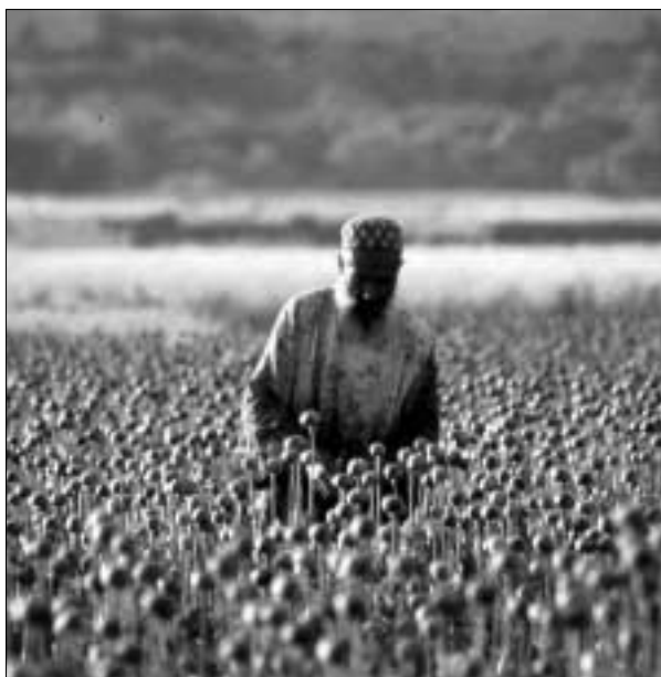
The Afghanistan case-study uses commodity-chain analysis for selected resources, including poppy cultivation and opium production

It must be stressed, however, that the direct investigation of commodity chains in situations of conflict and political crisis is likely to be highly sensitive, and so conventional research methods appropriate for peaceful situations will not be suitable. The safety and security of researchers, respondents and the agencies