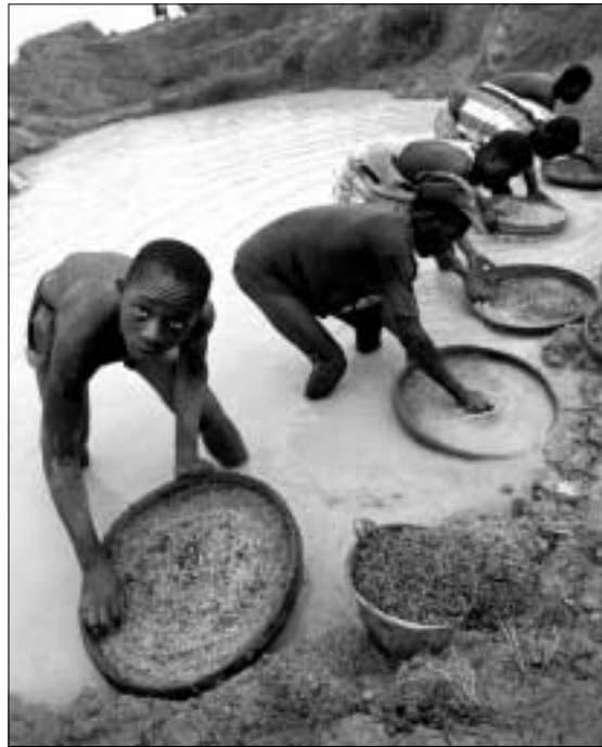
People search for diamonds, Kono district, Sierra Leone

Humanitarian programmes typically operate under time pressures and short project cycles that impede detailed analysis, particularly of the historical and political context of relief operations. To the extent that they are considered at all, political economy issues tend to be treated largely as background to the essentially technical business of delivering aid, rather than as a central and