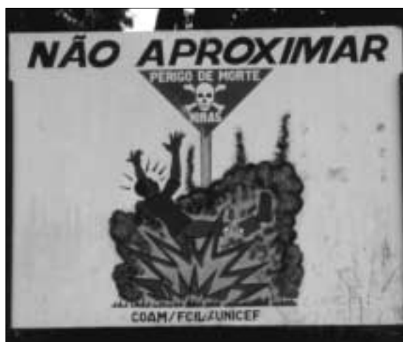
Despite the presence of landmines, security considerations did not greatly hinder research in Casamance. This landmine-awareness poster across the border in Guinea-Bissau warns people against approaching the area

This, of course, has resource implications for agencies. Some larger agencies might be in a position to create dedicated, specialist posts, to provide relevant training