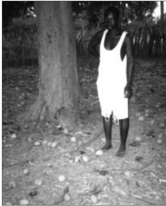
Rotting mangoes, Djinaki, Casamance: 'conflict mangoes' form an important part of the war economy in Casamance

local coping and survival economies. Each has distinctive features, but all are interconnected, with many actors engaged in more than one type. Terms such as 'licit' and 'illicit' economy start to look inadequate in these situations (as they do in many peacetime environments – see Chabal and Daloz, 1999). For instance, a particular community may be primarily engaged in subsistence agriculture within the 'coping economy'. At the same time, people may also have diversified their livelihood strategies to spread risk, including participating in the shadow and 'war' economies, for example through unregulated mining, smuggling or poppy cultivation. In one village in Afghanistan's Jaji District, for instance, the number of families engaged in growing cannabis increased from five to over 20 between 2000 and 2001. Likewise, different commodities – some essential to poor people's livelihoods and survival, others a key part of the war economy – may travel along the same commercial routes. In Afghanistan, for instance, warlords, conflict profiteers, traders and aid agencies all use the same informal money-changers ( sarafis ) and money-