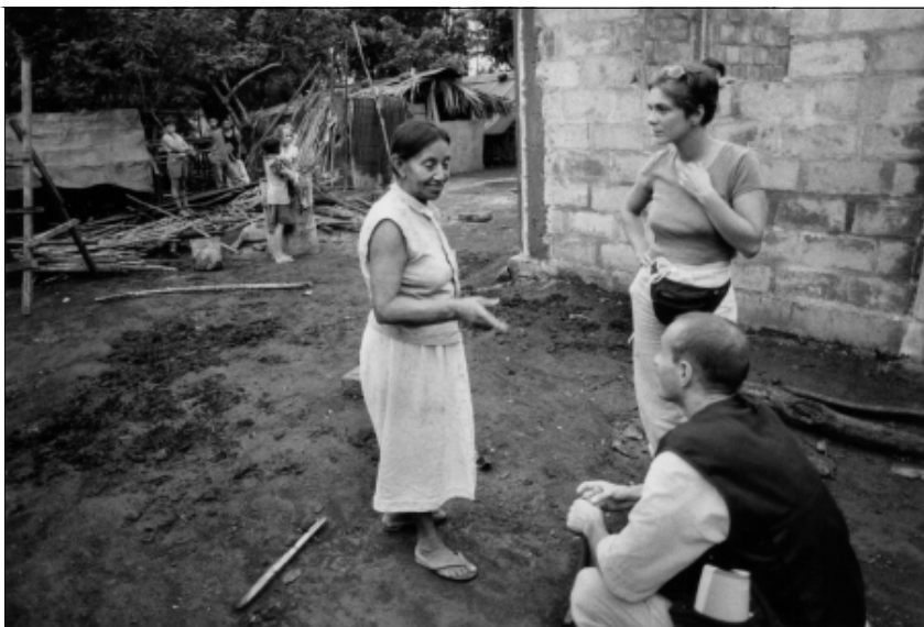
Interviewing a woman in Nicaragua

rather than relocate, and to continue working their farms with whatever seeds and tools were at their disposal. A number of DEC agencies and partners chose to prioritise agriculture for relief and rehabilitation. The provision of seeds, agricultural inputs and, in some cases, cash supported farming families who had decided to stay in their communities despite massive losses in harvest, housing, fields and livelihood. One Nicaraguan organisation went further. It brought a Cuban agricultural-extension specialist familiar with apante cultivation and other techniques to the community of Achuapa to make the most of the post-flood conditions. Later in the agricultural year, credit was given for equipment such as irrigation pumps, hoses and a communal tractor, all of which are atypical types of assistance in response to an emergency. Another organisation in Nicaragua advised people to sow white beans, watermelons and sesame as cash crops, and to grow maize in the off-season.