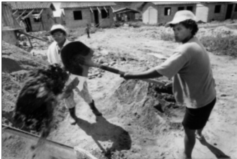
Rebuilding homes in Nicaragua

All the contributors underlined the lack of a legal framework and tools to address the land-rights problem, as well as the political and economic pressures that accompany it. This issue is a governmental responsibility. However, the governments concerned ignored their obligations, and local authorities did not have the technical and economic resources needed to satisfy the