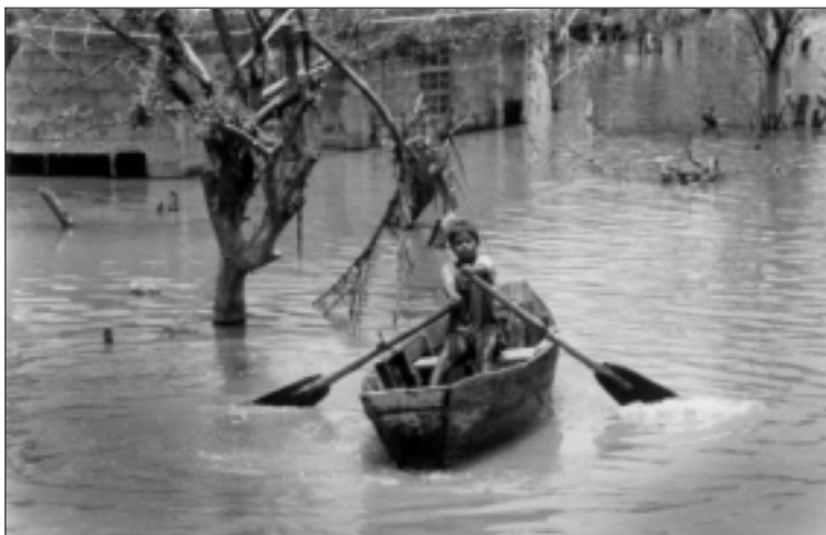
Flooding in Honduras

By 31 October, Mitch had begun to wane as it moved northwards, but still produced unusually high rainfall, flash floods and tidal surges in coastal El Salvador. By the time its centre reached Guatemala, the hurricane had lost much of its destructive force. Heavy rain still damaged infrastructure, but evacuations generally saved many lives, with the exception of poor neighbourhoods on steep slopes in marginal areas of Guatemala City, where most deaths occurred.