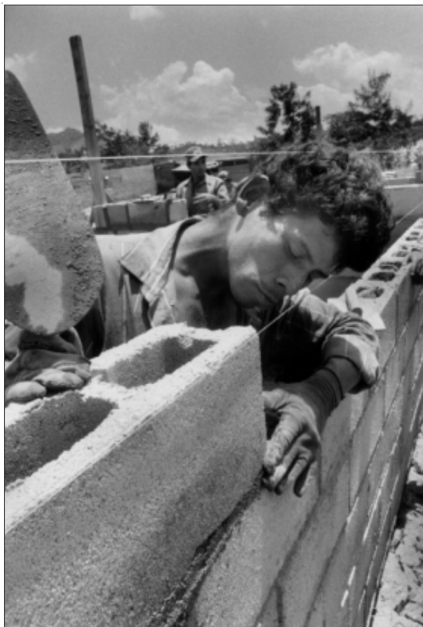
Self-help and Food for Work in San Juan, Nicaragua

With regard to the FFW programmes, it seems that a significant number had a positive impact in the short term in that they allowed peasants to stay on their land. However, in order to have access to a FFW 'habitat' programme, it was necessary to be registered with an NGO rehousing project. The incentive of an FFW programme meant that people were attracted to these kinds of reconstruction schemes, while people who wanted to rebuild their