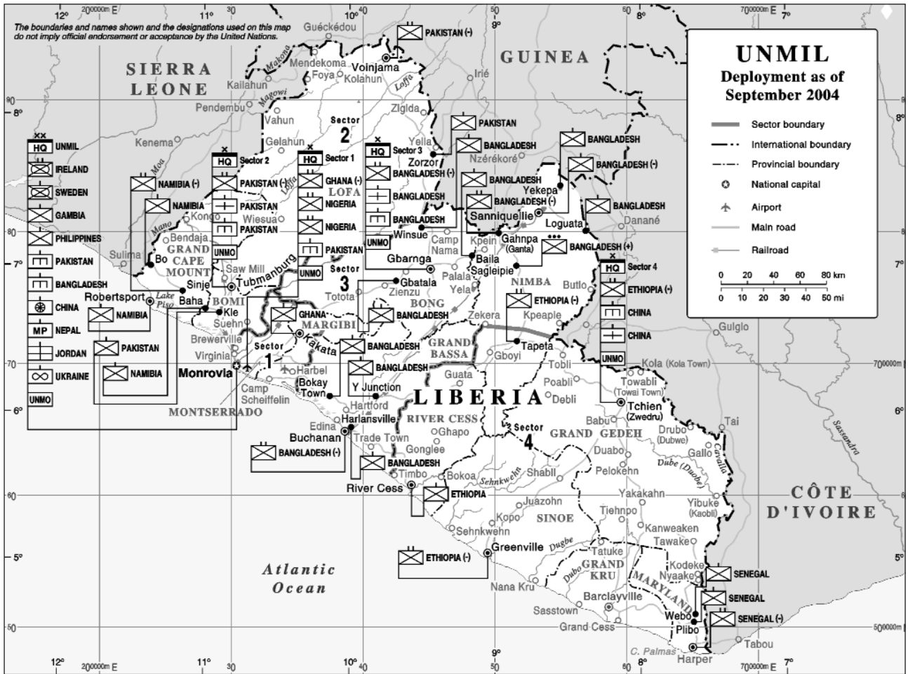
Figure 1: UNMIL Deployment

point out the tardiness of UN intervention in Burundi, more than one year after the deployment of the African Mission in Burundi (AMIB). 25