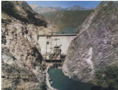
Toktogul Reservoir in Kyrgyzstan

at Atabashin, Alamedin, and Uchkorgon. Such stations have made possible the net export of electric power in varying amounts.